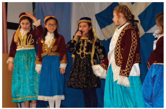
Older girls perform at Annunciation/Greek Independence Day program (March 22)