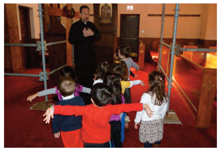
Preschool children learn about the Cross