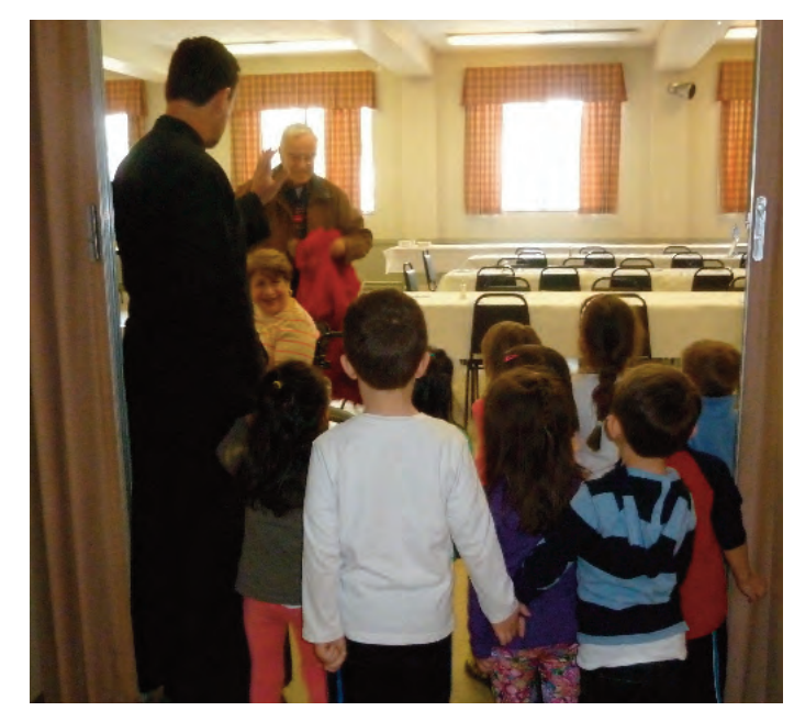
Preschool children visit the Seniors