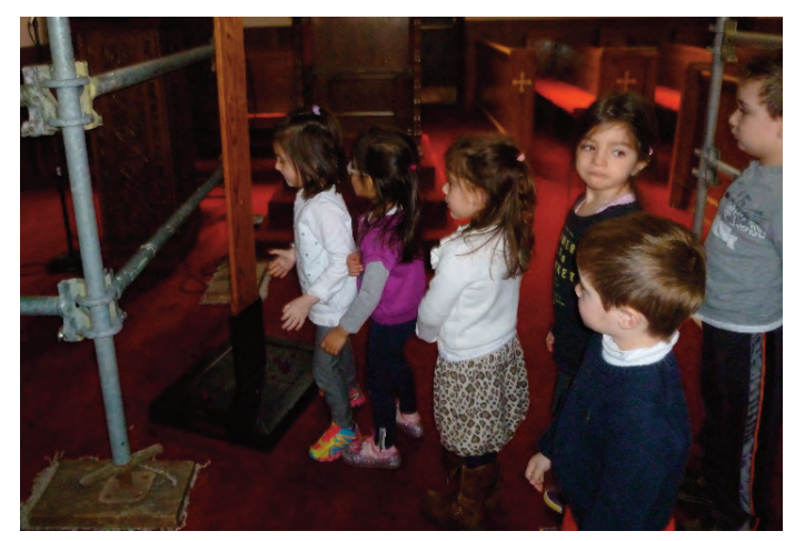
Preschool children venerate the Cross