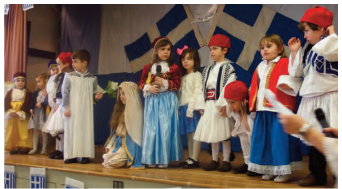
Girls perform at Annunciation/Greek Independence Program (March 22)