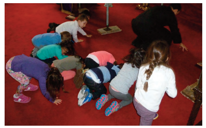
Preschool children learn how to make a prostration