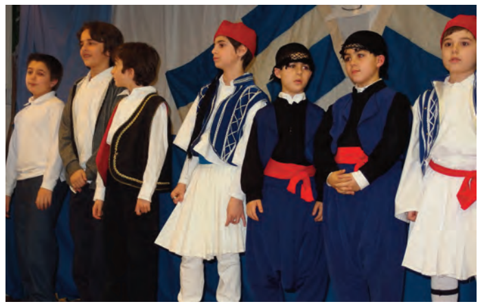
Boys perform at Annunciation/Greek Independence Program (March 22)