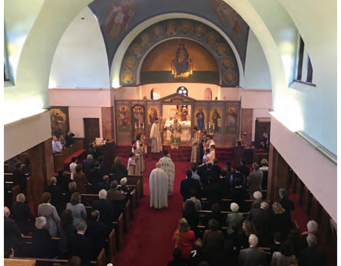
Visit of Archbishop Demetrios on our Parish Feast Day (Nov 8)

Further, the Church encourages us to modify other activities that, however good in themselves, often dominate us: to reduce our dependence on entertainment (e.g., watching television, going out to movies, listening to music, playing games on the computer), and to abstain from sexual relations with our spouse for a brief, agreed period of time. The purpose of all this is to grow in self-control and to free up time and energy for prayer, meditation, reading Scripture, observing silence, and serving others, especially the less fortunate.