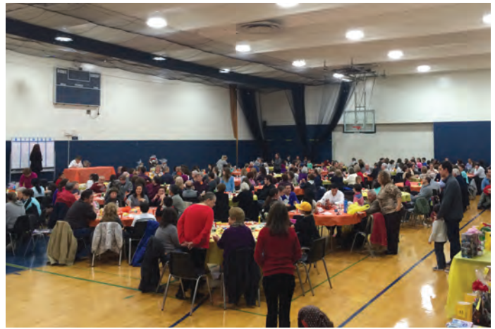
Gym is full for the annual Turkey Bingo (Nov 21)