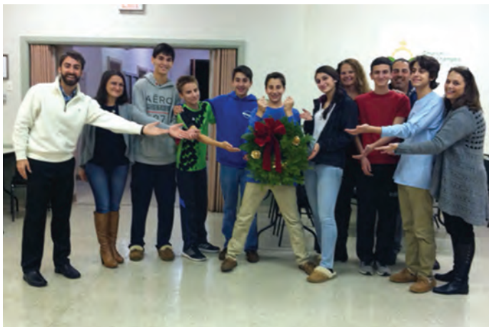
The GOY-Ans working hand-in-hand with parents and advisors crafted 25 beautiful Christmas wreaths to be sold as part of the annual fundraiser. Cost is only $25.