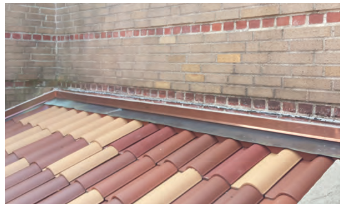
Beige replacement roof tiles show extensive damage from last winter

The Committee had mixed results this past month. We are much clearer now on integrating our existing HVAC system with the proposed work. We have yet to approve a proposal from Redniss & Mead for site/civil engineering services to be utilized in the local I& use entitlement process & for subsequent use in bidding & construction. We were excited to hear from the Capital Campaign Committee that the anonymous matching grant of $250,000 is starting to get traction. Please keep this momentum going! If you have not seen the marketing materials from the Capital Campaign Committee, please do so; they are great. Questions: Contact Jason Konidaris