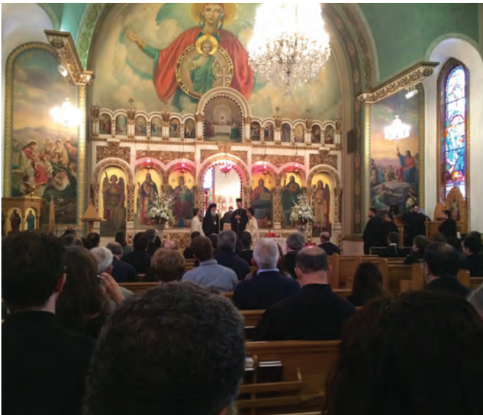
180 Clergy from around the country at Liturgy in San Diego during National Clergy Retreat (Nov 3-6)