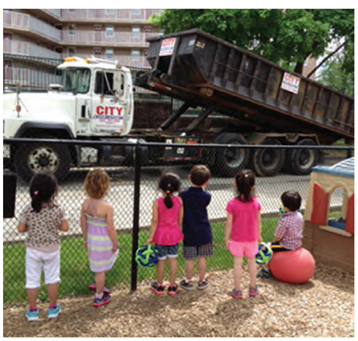
Preschool children watch as a dumpster is loaded and removed (May 13)

For additional information, see the IOCC website at www.iocc.org. Contact our IOCC representative, Tim Hartch, at timhartch1@outlook.com.