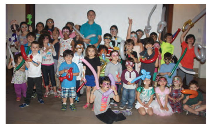
Children gather during Greek School Celebration @ Bank Street Events (May 19)