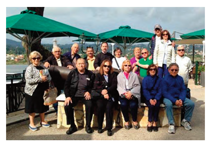
Pilgrimage group gathers on Corfu (Kerkyra) around a large cannon that symbolizes the western European powers who ruled the island for centuries (May 2)