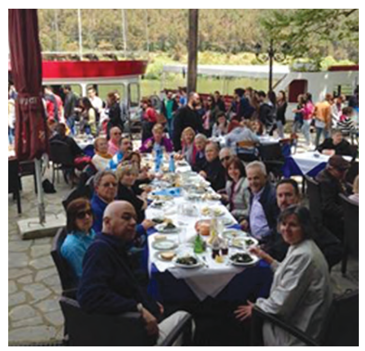
Pilgrimage group sharing lunch during a brief visit to Ioannina en route to Corfu (May 1)