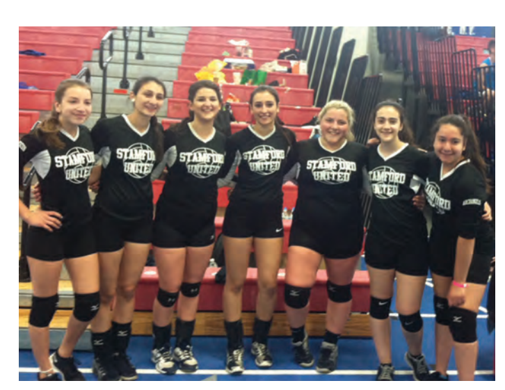
Stamford United Volleyball team wins silver at the GOYA Olympics (May 23)