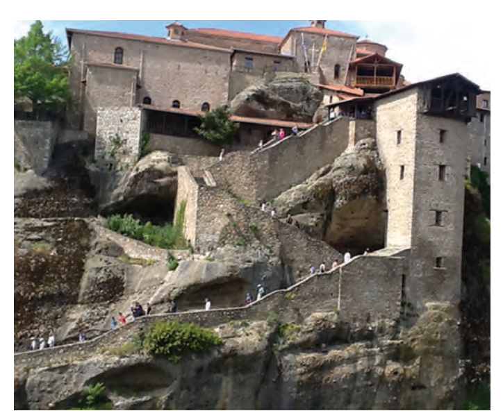
300 steps that lead to Megalo Meteora Monastery (April 30)