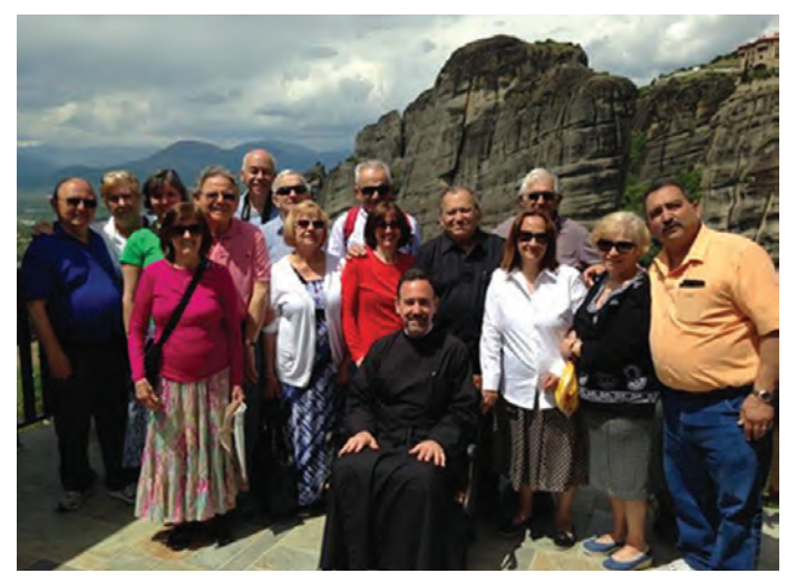
Pilgrimage group gathers at Meteora after visiting Megalo Meteoro, the largest monastery (April 30)