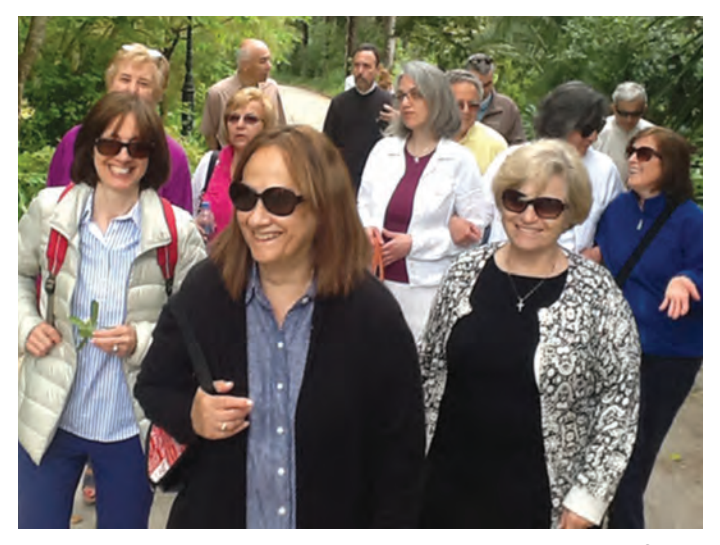
Pilgrimage group touring Mon Repos Palace and Estate on Corfu (May 2)