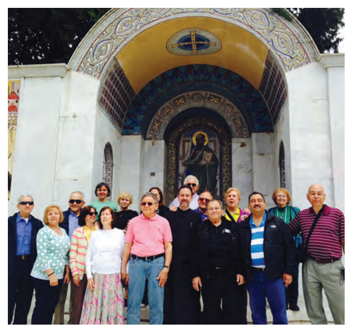
Pilgrimage group at Shrine in Beroea where St. Paul preached (April 29)