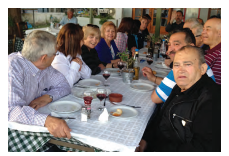
After being reunited, the group enjoys a meal in Psakoudia, near Ormylia (April 28)