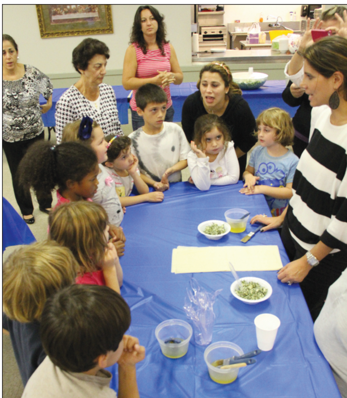
Parents teach children how to make spanakopita (spinach pie) during Greek School Open House (Oct 8)