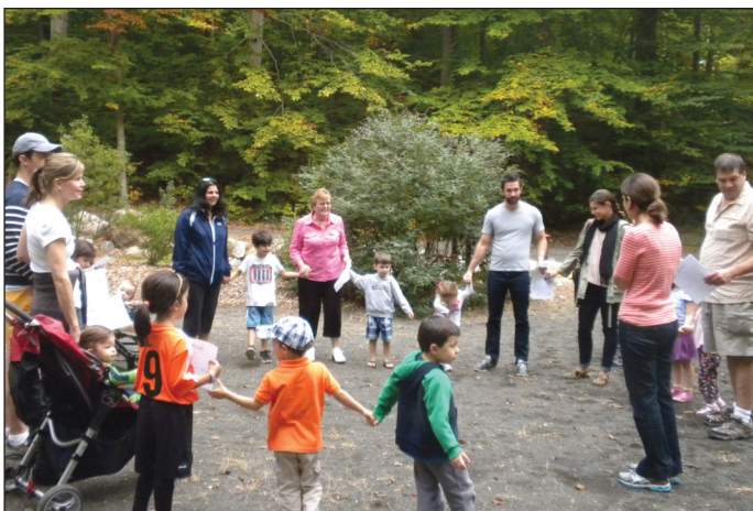
Parents & children at HOPE/JOY Field Trip to Stamford Museum & Nature Center (Oct 5)