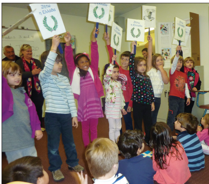
Greek School 1st graders hold signs “Long Live Greece!” at Oxi Day celebration (Oct 29)

Choirs from St. Joseph Roman Catholic Seminary and St. Vladimir Orthodox Theological Seminary will present an evening of Sacred Song entitled Magnificat, hymns to the Mother of God from East & West. Includes selections from our Orthodox Church Feasts of the Mother of God (Annunciation, Dormition, etc), and Roman Catholic hymns such as “O Sanctissima” by Beethoven (died 1827) and “Ave Maria” by Biebl (died 2001). Location: St. Jean Baptiste Church, 184 East 76th Street, New York City. Time: Mon, Nov. 25, 7:30 pm. Tickets: $25. Order online at www.svots.edu . Limited tickets available at the door. Don’t miss this ecumenical Catholic-Orthodox program!