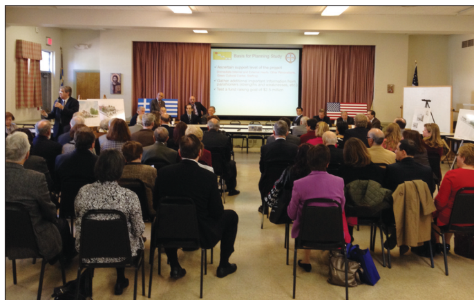
Jerry Minetos presents at Town Hall Meeting on Master Plan (Oct 27)

Dinner (& take out meals) 1 pm. Offered free of charge to those who cannot afford it as well as those who simply wish to share with others. Contact: Office at 203-323-0200 for reservations, directions, rides, shut-in meal delivery, or to volunteer your time or make a donation.