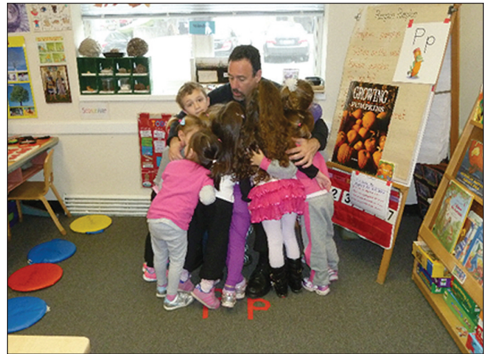
Preschool group hug at the end of a Pastoral visit on Wednesday mornings.