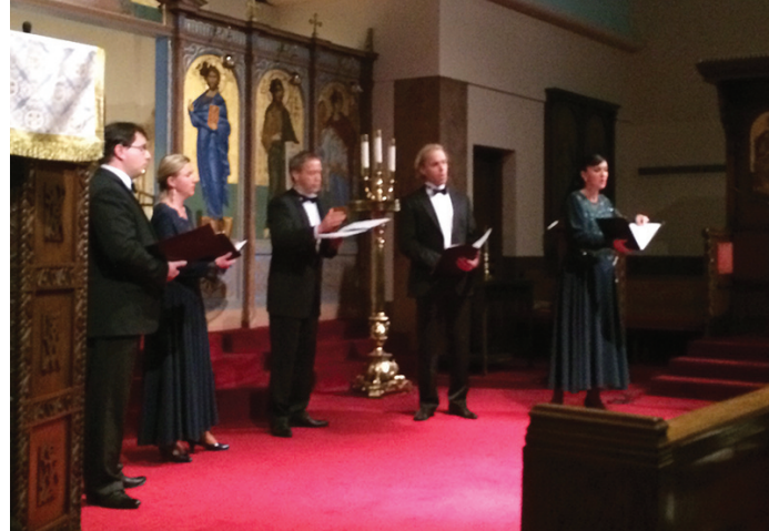
LYRA Concert - sacred music of Orthodox worship (Oct 24)