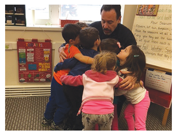
Preschool group hug! (Oct. 20)