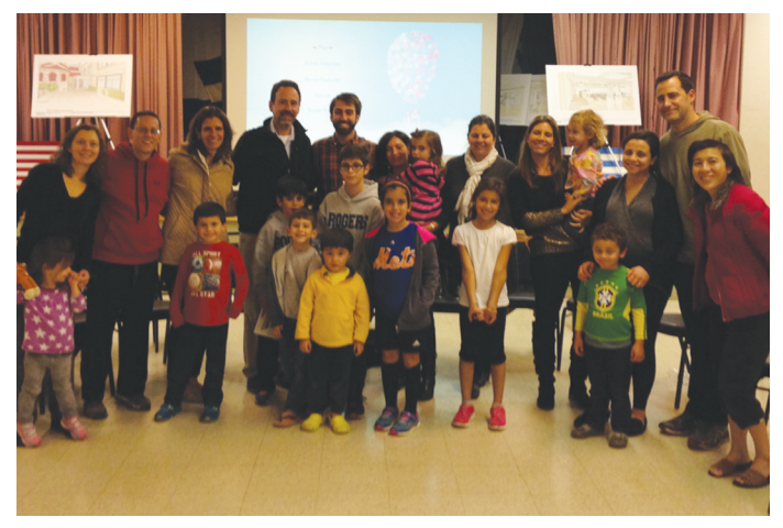
Our first family Movie Night was held Oct. 16 in the church hall. It was a delightful evening for all 9 families in attendance.