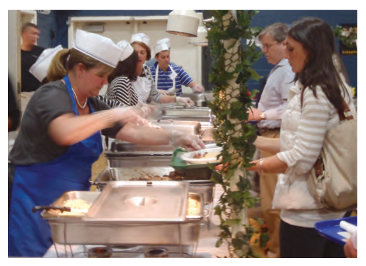
Dinner line at the Festival

Enjoy some photos included in this newsletter.