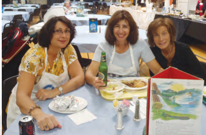
Taking a well-deserved meal break