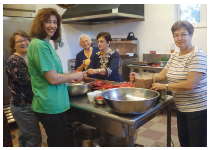
Women prepare Gemista (stuffed tomatoes)