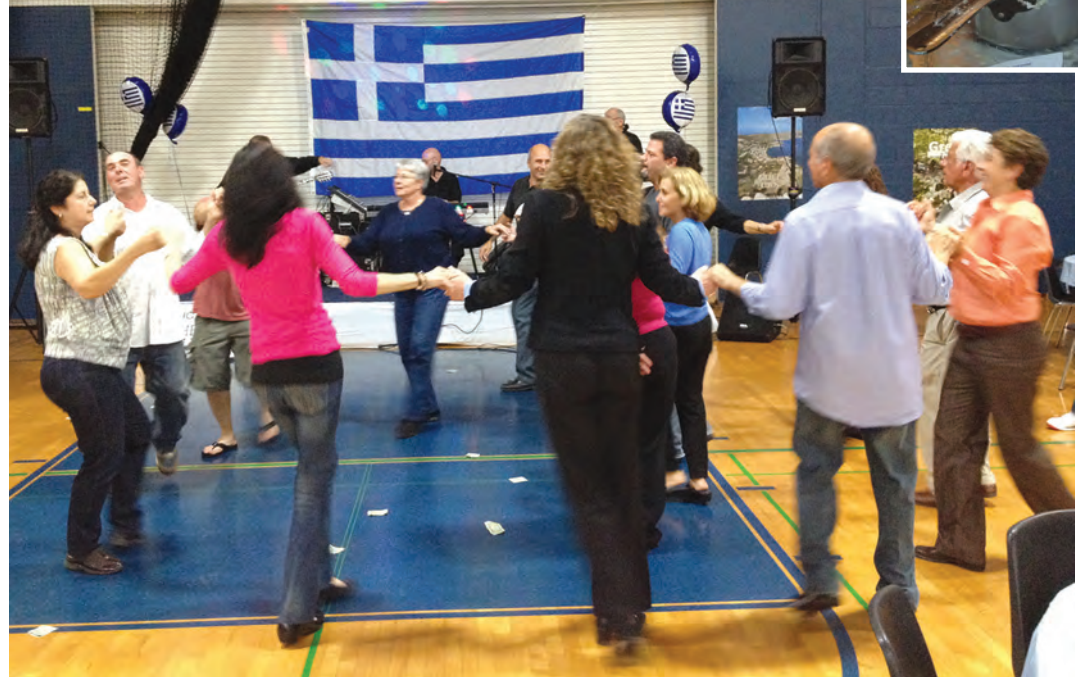
Greek dancing was enjoyed by all