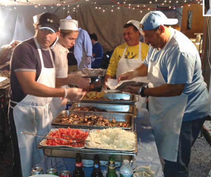
Making Souvlaki (shish-kebab) and Gyros