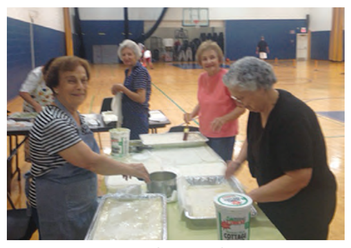
Women bake Spanakopita (spinach pie)