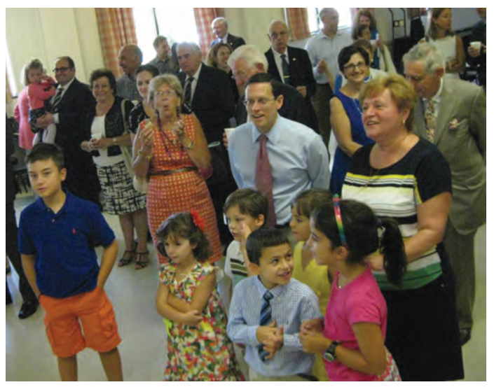
Crowd gathers to cut cake in Coffee Hour in celebration of Grandparents Day (Sep 13)