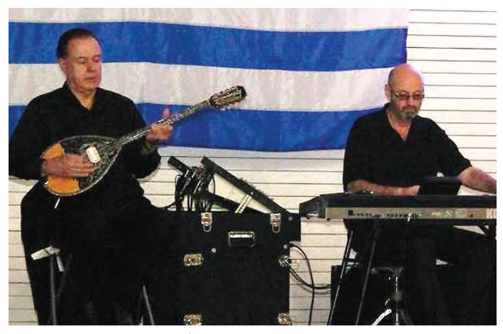
The "Grecian Nights" perform traditional Greek songs, giving our Fest some extra pep and flavor with their bright music.

Greek School is officially in session! Kali hronia se olous! The Greek School faculty and students are already eagerly preparing for OXI Day which is our first celebratory program of the