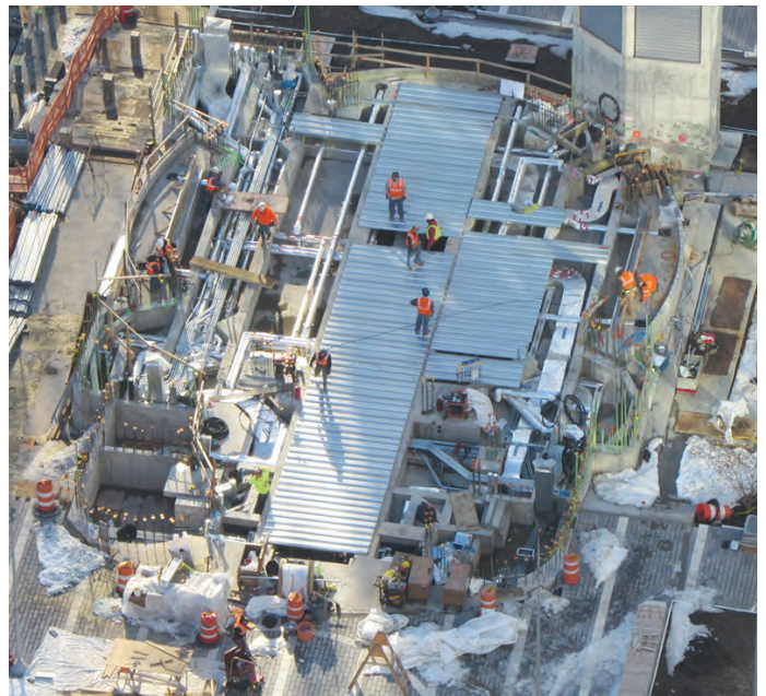
Aerial photo of metal deck being installed for St. Nicholas National Shrine at Ground Zero (Feb 2)