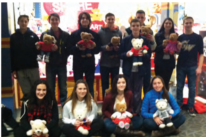
The GOYANs met at the Build A Bear store at the Trumbull Mall on MLK Day to decorate (aka 'build') teddy bears to be given to pediatric cancer patients at the Ronald McDonald House in Manhattan.