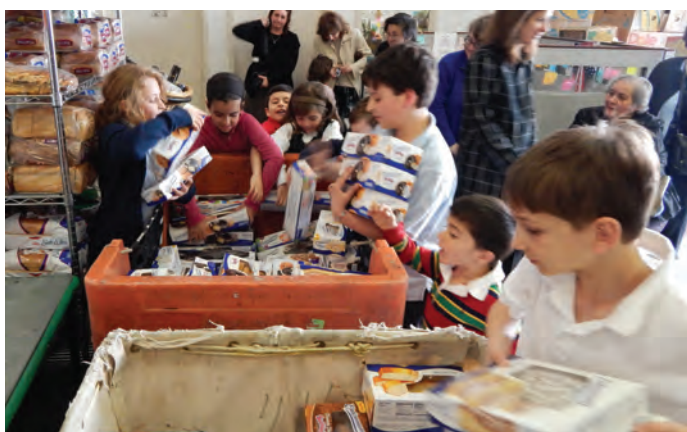
Youth in HOPE/JOY transfer foodstuffs from bins to shelves at Lower Fairfield County Food Bank on Holy Wednesday.

Our Palm Sunday bake and bread sale was a great success. We are most appreciative of everyone who supported our effort. Much work goes into this sale from baking groups