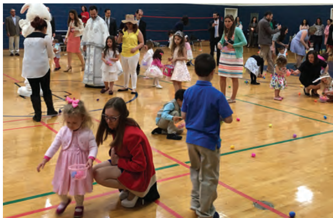
Above & below: Children's Easter Egg hunt in the gym due to rainy, cold weather (May 1)

Keep in mind the upcoming dates & events for May 2016: