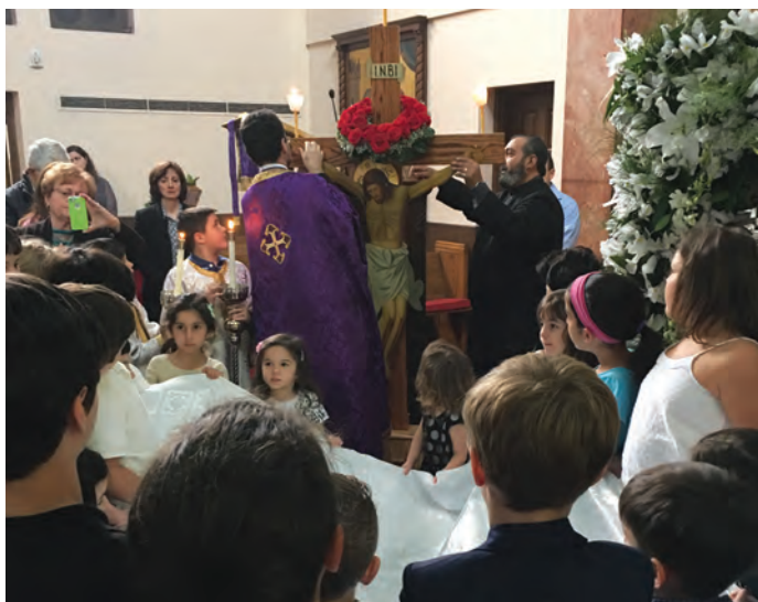
Un-nailing of Christ from the Cross on Good Friday Vespers (April 29)