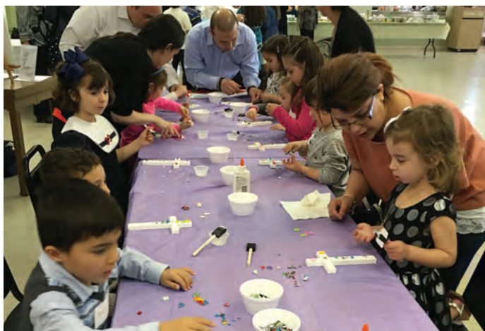
Children making Crosses on Good Friday (April 29)