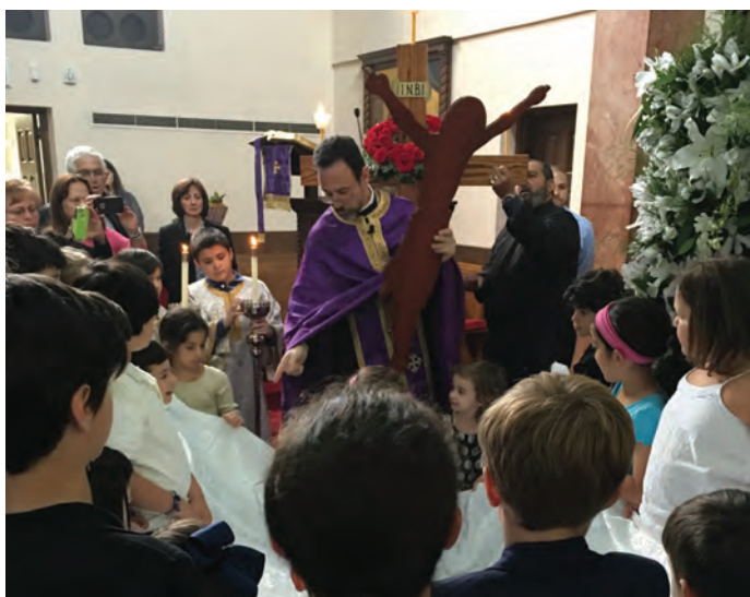
Children assist with covering Christ's body with linen cloth at Good Friday Vespers (April 29)