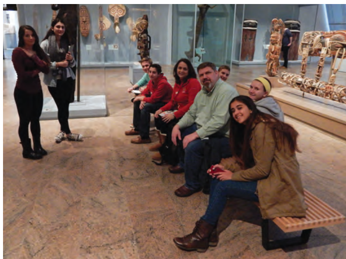
The GOYA takes a break after finishing their hunt for answers at the MET for the annual NY District Scavenger Hunt. Congrats for their 1st place finish!