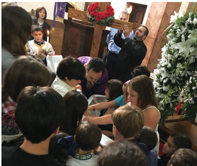
Children cover Body of Jesus during Good Friday Vespers (April 29)