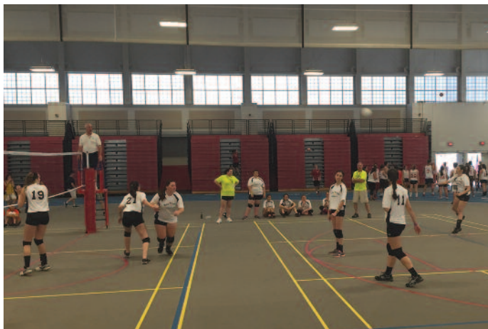
The combined Bridgeport-Stamford volleyball team in action at the GOYA Olympics held Memorial Day weekend; they placed 3rd overall!