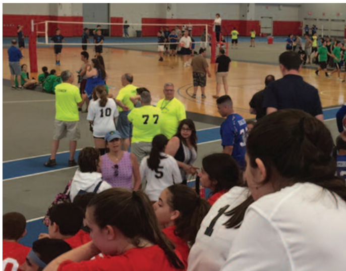
Teen girls volleyball players waiting in the stands for their next match at the 2016 GOYA Olympics held in Long Island.