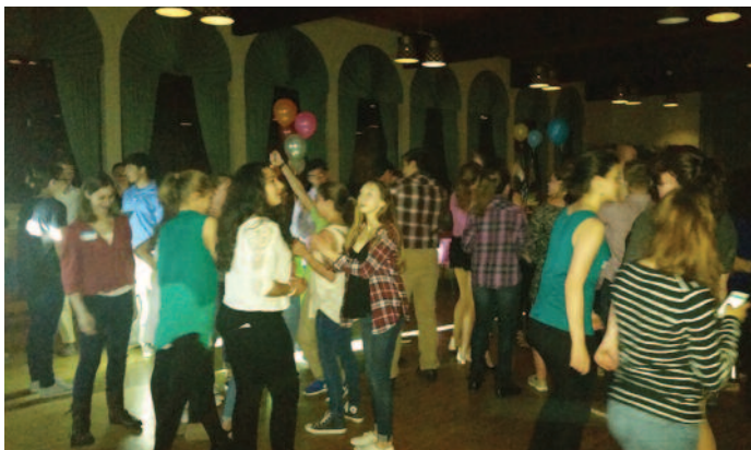
Over 65 teens from across the state came out for the year's first GOYA Dance, hosted by Holy Trinity in Bridgeport.