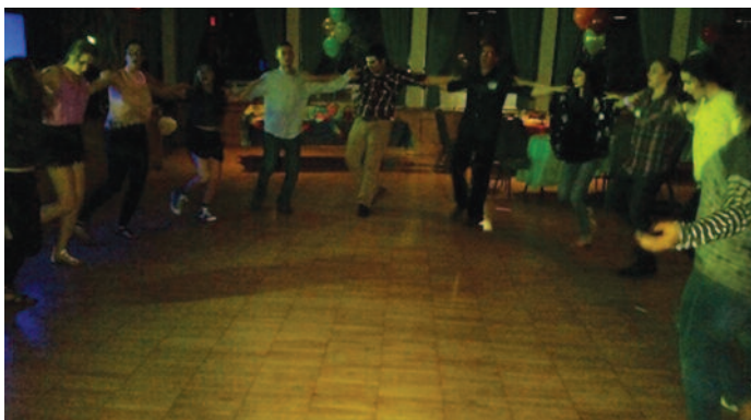
No GOYA dance is complete without some classic Greek folk songs. OPA!