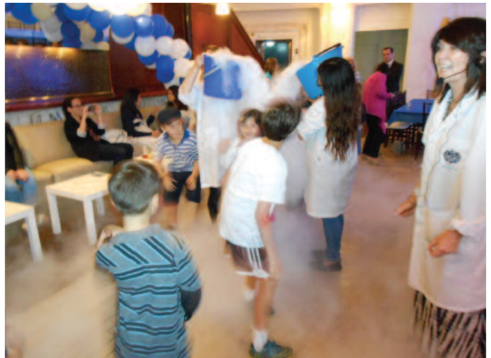
Children have a blast walking through a waterfall of steam at the GS Party; entertainment was provided by the Mad Science Group of Fairfield.

Sponsored by Church School, Preschool & Little Angels