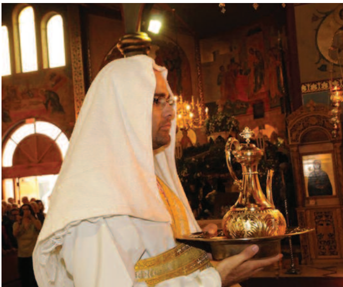
A candidate for ordination to the Diaconate stands in front of the Icon of Christ during the first part of the Liturgy, all the while holding a pitcher of water & bowl with towel over head.