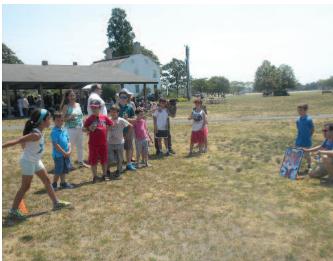
JOY/HOPE Bean Bag Toss (June 26)

Contact Tim Hartch at timhartch1@outlook.com .