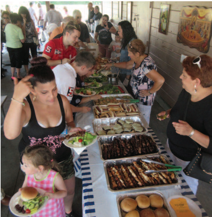
Lunch Line at Parish Picnic (June 26)