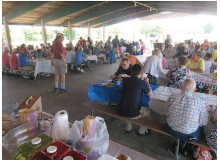
Pavilion packed with a crowd (June 26)

The AYA is in most part a conversational ministry in which young adults can gather to have focused conversations in various environments (i.e. church, restaurant, park) that are both authentic and open, so to develop strong relations between persons and to grow together in Christian faith. The approach here is like the one described above. On Thursday June 23rd, three of our young adults gathered together for food, conversation and parea (fellowship) at the popular haunt Coalhouse Pizza on High Ridge. Like most of our gatherings this year, it was intimate yet substantive. Discusses on Orthodox spirituality and "new age spirituality" and our individual experiences of spiritual refreshment during Holy Week organically sprung up and enticed us as much as the food. Making time for these conversations & giving time for such relationships to mature is slow. What we've seen thus far though, is that when they happen, and