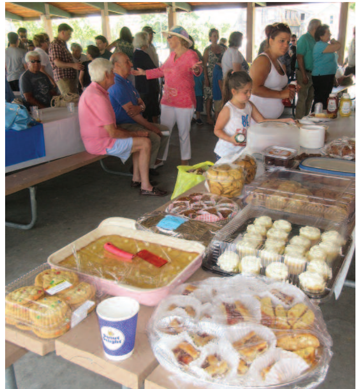
Desserts at Parish Picnic (June 26)