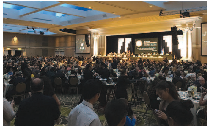
More than 1,000 attend Grand Banquet of Archdiocesan Clergy-Laity Congress (July 7)