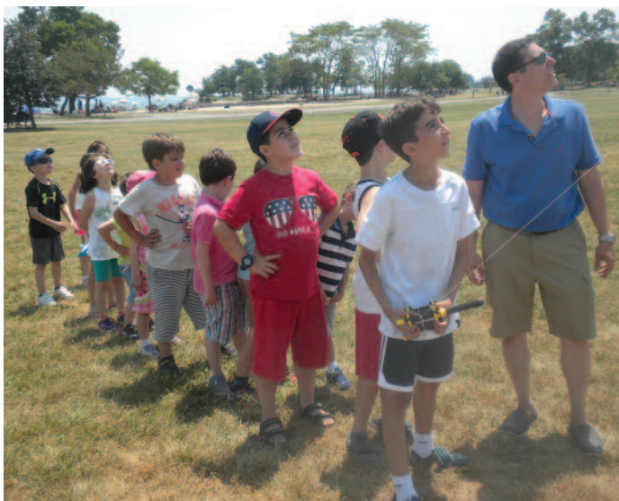
JOY/HOPE Kite Flying (June 26)