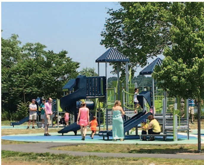
Enjoying the nearby Playground at Cove Park (June 26)