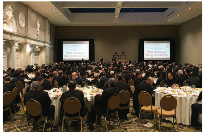
About 300 clergy at Breakfast with Archbishop Demetrios at Clergy-Laity Congress (July 5)