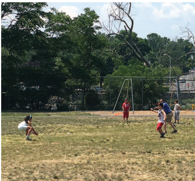
JOY/HOPE Whiffle Ball game (June 26)