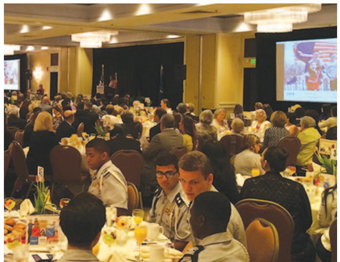
Celebratory Breakfast of Neighbor's Link, and interfaith ministry for Immigrants in Stamford (June 1)