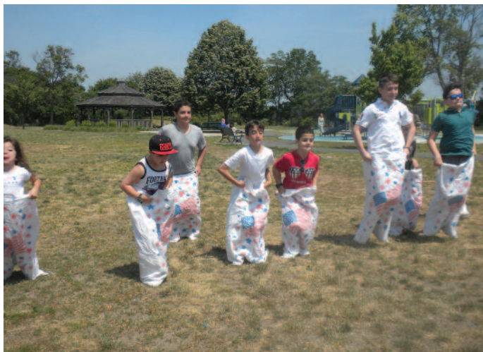
JOY/HOPE Sack Race nears the finish line (June 26)