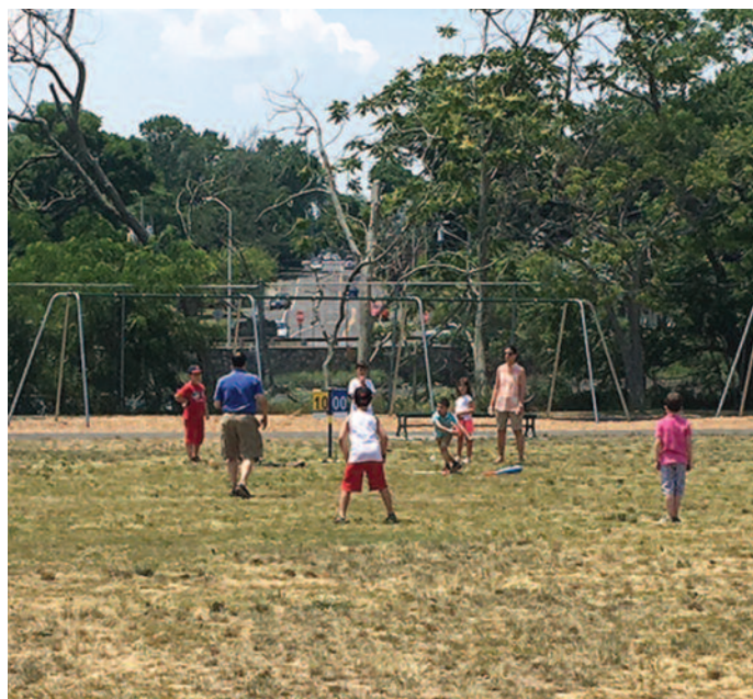
JOY/HOPE Whiffle Ball game (June 26)