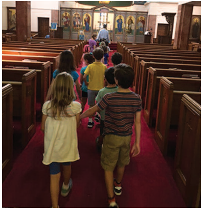
Children process into the church nave for morning prayers: the best way to start the day!