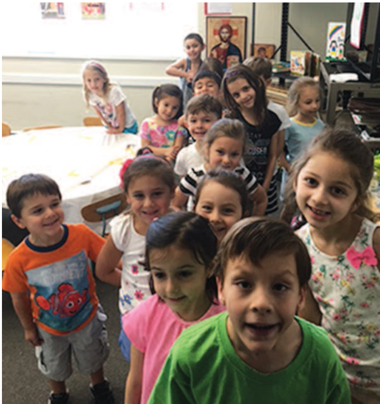
Say "cheese!" The children at VCS weren't shy to show their pearly whites.