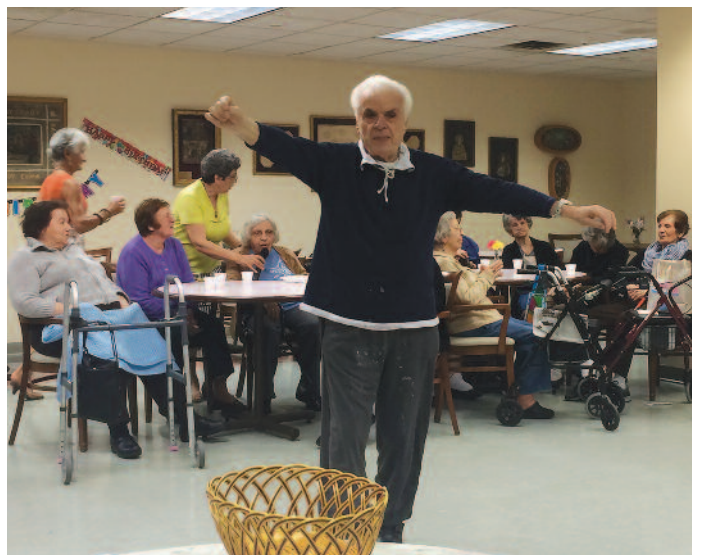
Our Philoptochos reps celebrate with dancing, cake, and fellowship at St. Michael's Home in Yonkers.