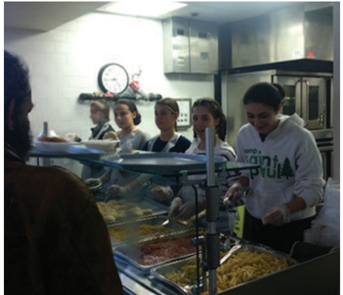
Archangels & Annunciation teens came together to serve hot meals to those in need at New Covenant House soup kitchen on Saturday, Oct. 29.

We've had a busy and meaningful October, beginning with our Bible Scavenger Hunt at the Stamford Museum and Nature Center on October 1st. Then, on October 14th, we attended our second meeting at our sister Parish, Church of the Annunciation, with the theme of "prayer." We enjoyed learning about how prayer was the original "wireless communication." On Saturday, October 22nd, members of Hope & Joy and Little Angels participated in a joint ministry "Family Fun Fitness Day." Children were led through fitness stations that included basketball, soccer, balloon volleyball, an obstacle course, jump roping/hula