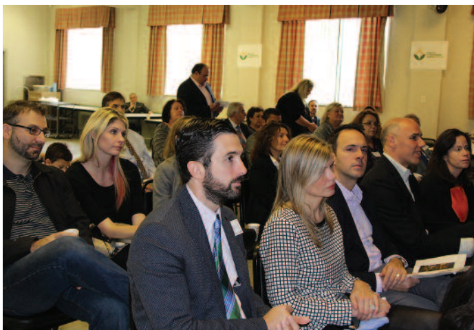
Parents attend the Greek School Open House after Liturgy on Sun. Oct. 16.