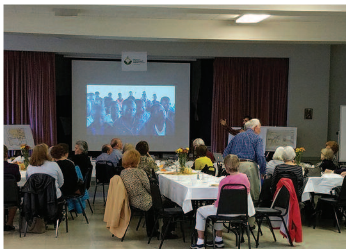
Seniors gather for a lively monthly meeting on Wed. Oct. 5 in the hall, including a pastisio luncheon and a presentation.