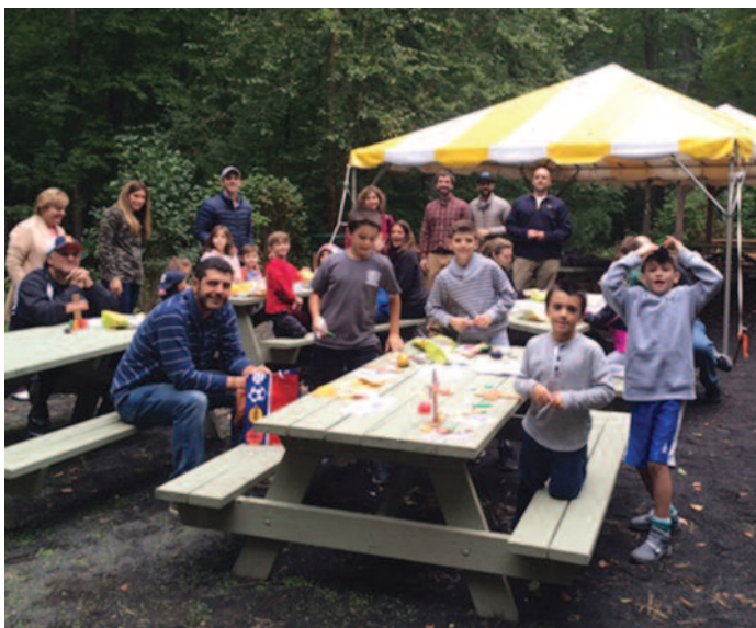
Archangels (as well as Annunciation) HOPE/JOY gather at the Stamford Nature Center on Sat. Oct. 1 for the Nature Outing.