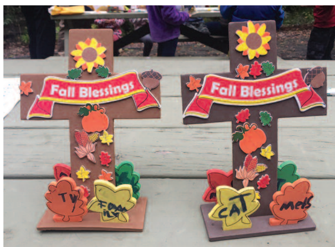
The children's craft was a "fall Cross" which highlighted things they were thankful for.