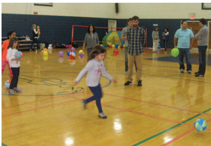
Little Angels and HOPE/JOY children have a blast at SAC gym during the Family Fitness Day on Sat. Oct. 22.