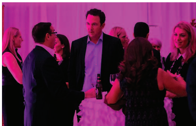
Parishioners, friends, and special guests enjoying a fantastic cocktail hour at the Capital Campaign Comedy night in the (transformed) Athletic Center gym.