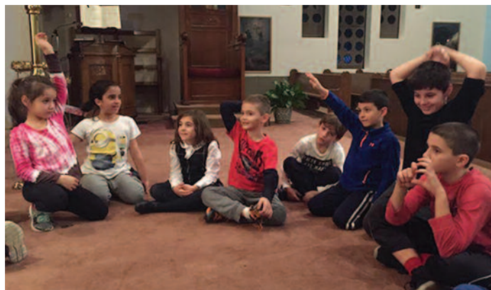
Archangels and Annunciation children gather at their monthly meeting at the Church of the Annunciation in November.