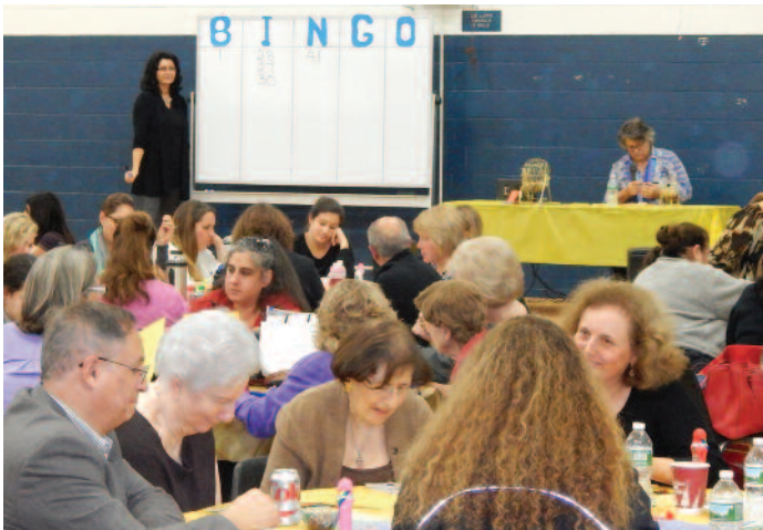
There were over 230 in attendance at the annual, and ever enjoyable, Turkey Bingo held in SAC and put by our Ladies Philoptochos.