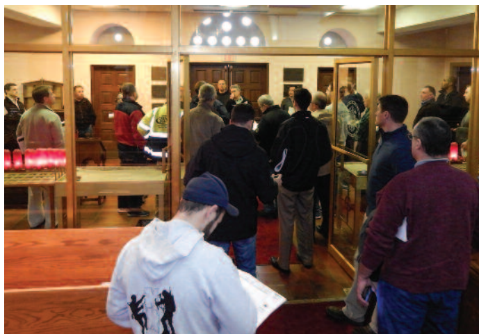
A group of two dozen contractors are being given a tutorial in the Narthex, as the bid process for Capital Campaign renovations kicks off.