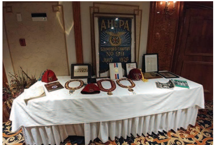
Stamford & New Haven AHEPA 90th anniversary dinner-dance: memorabilia