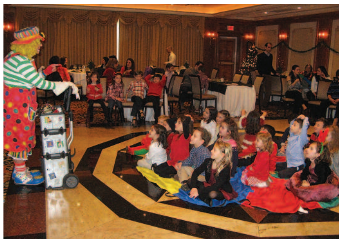
Children watch attentively as Sunny the Clown performs some magic tricks at the Christmas Party. (Dec. 10)