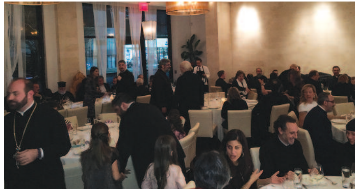
Clergy families celebrate Christmas with the Archbishop at Limani Restaurant in Roslyn, NY (Dec. 28)