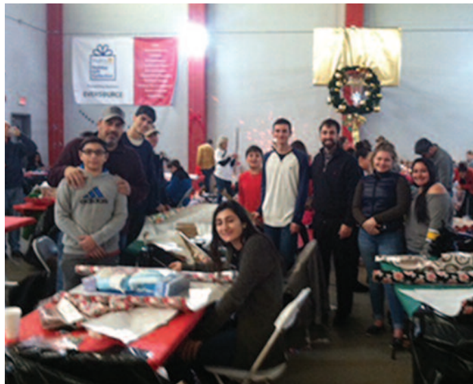
Teens smile for a group shot on Dec. 10 at the INSPIRICA holiday gift wrapping, where they wrapped hundreds of gifts for less fortunate children alongside dozens of other volunteers.