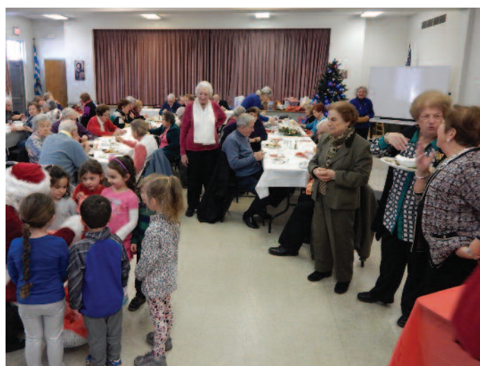
Santa Claus surprises the Preschool children with gifts and hugs when they came to the Seniors meeting to wish the group Merry Christmas (Dec. 14)