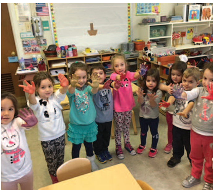
Preschool children have fun learning how two primary colors make a secondary one (Dec. 16)