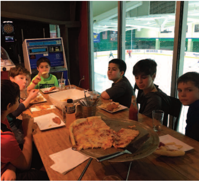
The Greek School children enjoyed food and games at Chelsea Piers on Jan. 16.