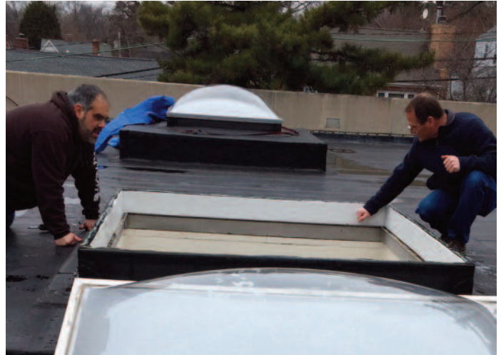
Representatives of the Velux Skylight Company investigate recent skylight leaks at the Stamford Athletic Club.