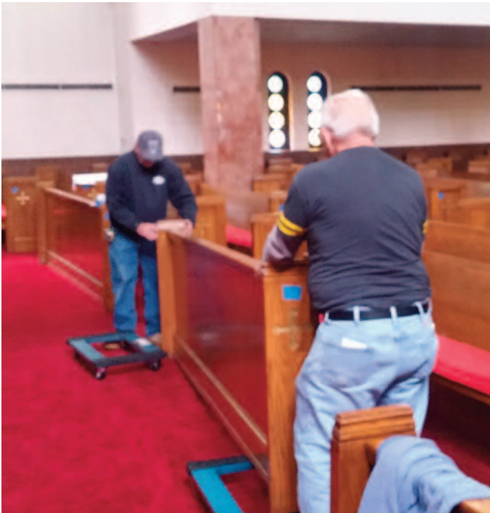
Contractors move out the first row of pews from the church into the hall (Wed. May 24).

We continue to provide essential services and repairs to the Stamford Athletic Club. Our most recent upgrades included: New emergency fire exit sign installation (per code) along the stairwell leading to the third floor boxing area. Our lighting upgrades continue, creating a visible improvement in our basketball court and pool. The commercial clothes dryer recently required a motor replacement. We also performed duct cleaning of the exhaust system. At a recent Foundation meeting a list of various items in need of repair or replacement was presented for consideration. Major items include roof replacements, men's locker room HVAC unit, and exterior roof wall resurfacing. In the church we are in the process of soliciting bids to replace the boiler. We continue to investigate the women's shower drain system which had given us trouble. Upon completion of Part II of our master plan, replacement of our asphalt roadways and driveways will be given consideration. Contact: Peter Licopantis, pglydl3@optonline.net