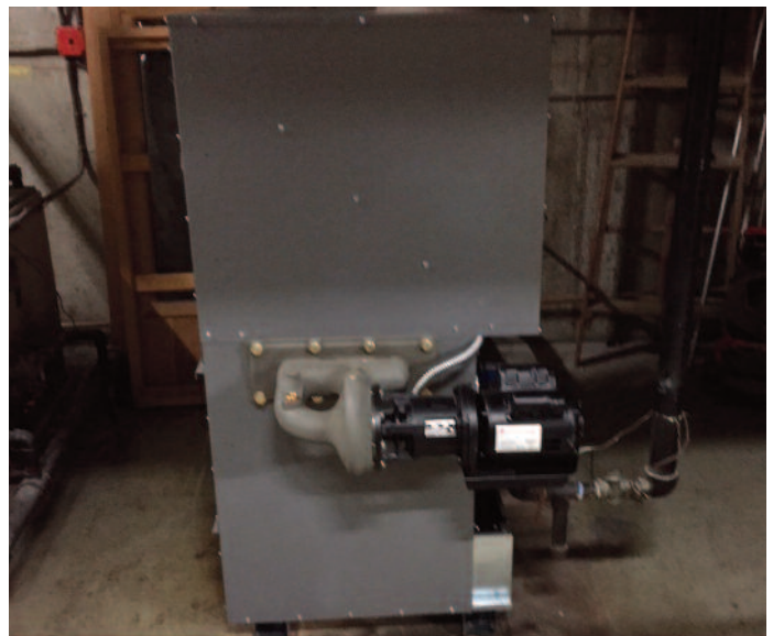
Buildings and Grounds Committee oversees the installment of a new boiler in the Cultural Center (Sept. 27)