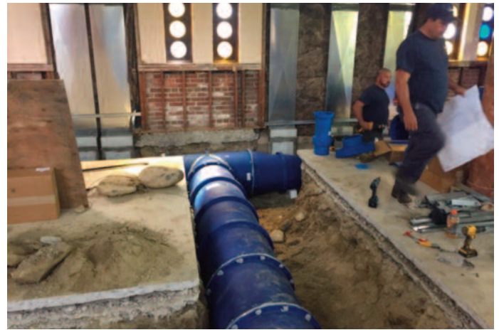
The south sidewall and floor channel in the church nave receive new HVAC 'BlueDuct' (Oct. 10)