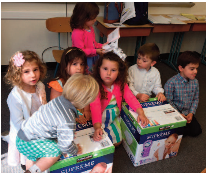
Little Angels children pose for a picture at the conclusion of the summer time Diapers, Wipes, and Formula drive (Sept. 10)