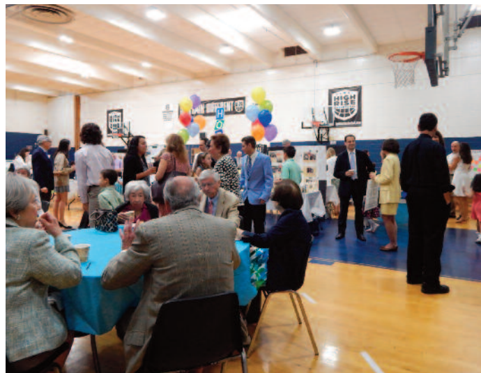
Parishioners enjoy the contagiously warm atmosphere at the 3rd Annual Ministry Fair (Sept. 10)