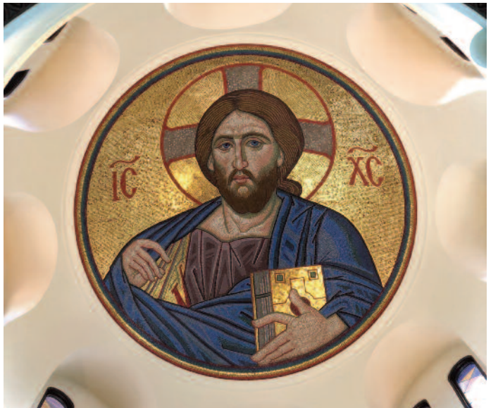
Pantokrator ("Christ Almighty" holding the Gospel book) in the Dome (week of Dec 17)