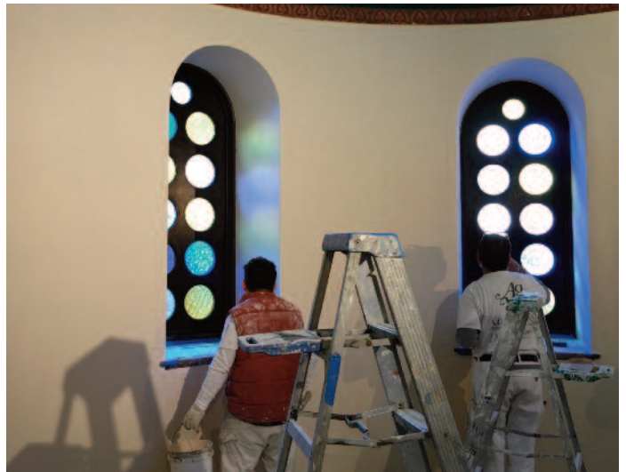
Painting the altar area (Dec 27)