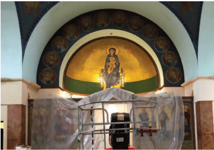
Church Renovation: first coat of primer paint on walls (week of Dec 17)