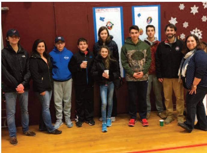
The GOYA volunteered at the DOMUS organization's Holiday Mall on Saturday, December 23, helping parents of at-risk children 'shop' for Christmas gifts.

the 5th year in a row, the DOMUS Giving Tree gift donation drive was a success! Forty gifts were generously purchased by community members and delivered to DOMUS headquarters by our GOYAns; these gifts help bring smiles to families throughout the area. THANK YOU for your support of GOYA and DOMUS! On Saturday, December 23, the GOYA volunteered at the DOMUS Holiday Mall, where local parents of 'at-risk' and underprivileged youth came to "shop" for gifts. Every year our teen group intentionally involves itself in service to the community. Last year we participated in the Inspirica Wrapping Party; this year in the Holiday Mall. Both allow us to prepare for Christ's birth by opening our hearts to those in need by serving them. It was a beautiful morning of service work for our GOYAns. Please mark your calendars for these upcoming events: