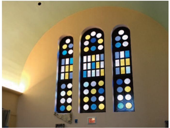
Freshly painted South Transept, matching original colors (Dec 27)