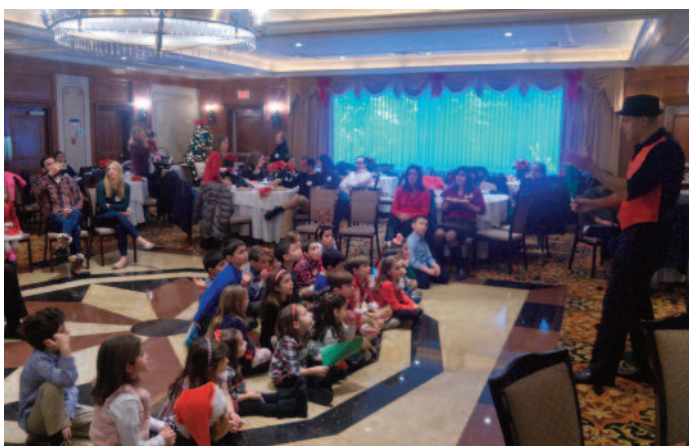
Children listen in rapt attention to a magician perform