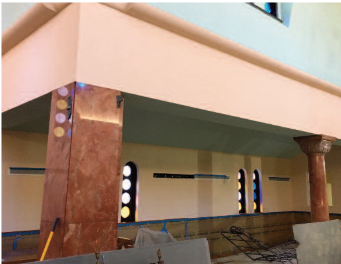
Freshly painted portion of nave (Dec 27)