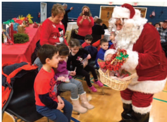
The preschool children enjoyed a visit from Santa at the Senior Christmas Party (12-13-17)