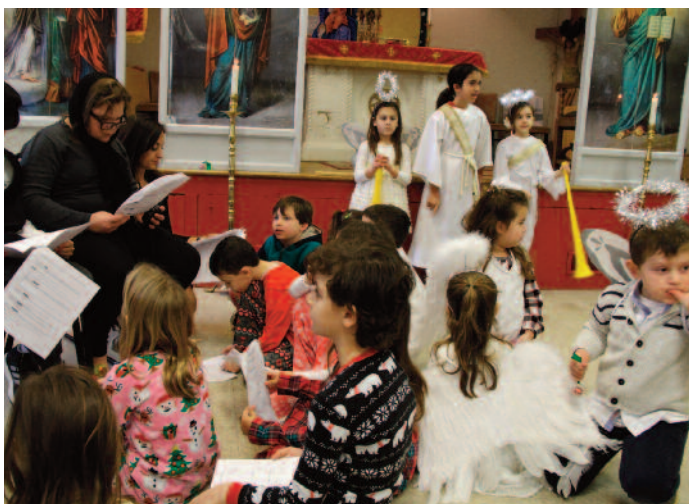
Church School and Greek School children perform the 2017 Christmas Pageant in the hall on Sunday, December 17.