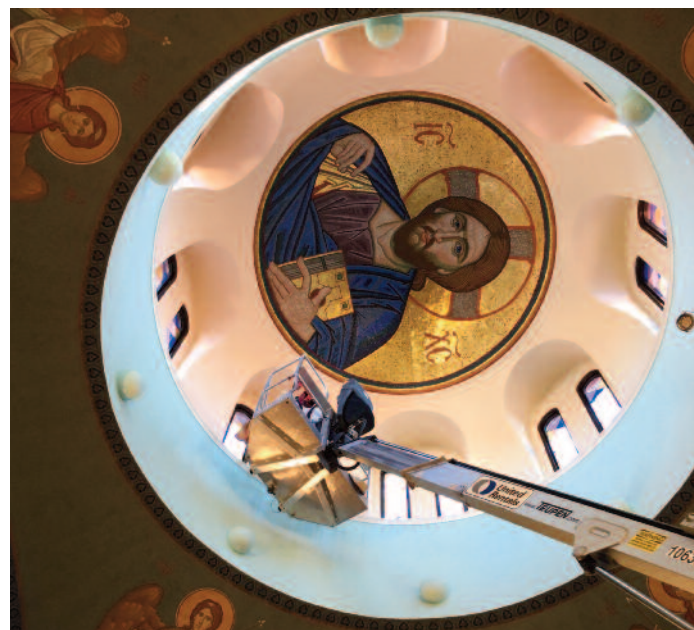
Painting the dome on a lift (Dec 27)