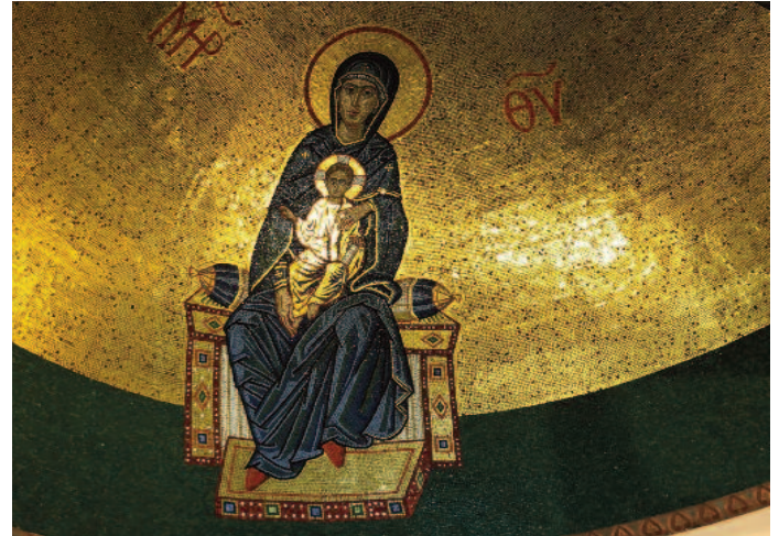
Before and after professional cleaning of the Platytera (Virgin Mary "Wider than the Heavens" holding the Christ child) in the Apse (week of Dec 10)