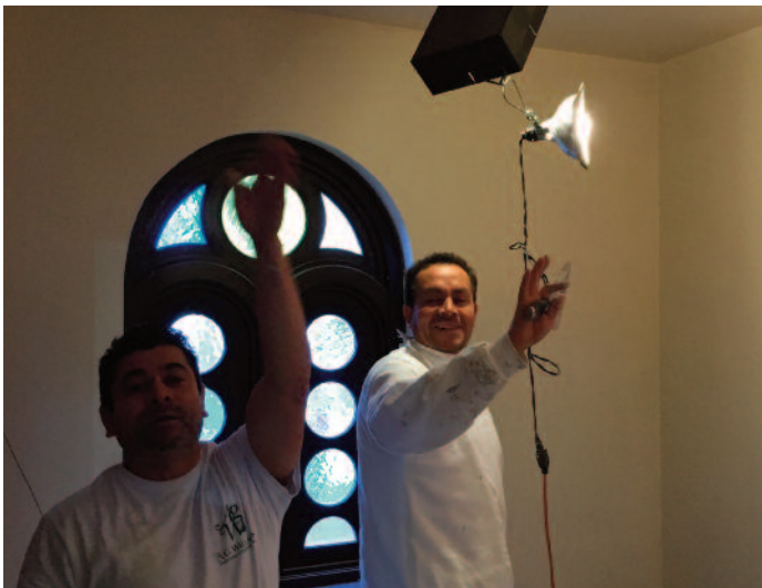
Painting the Sacristy (Dec 27)