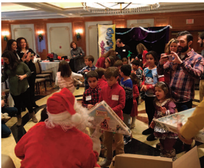
Children line up to visit Santa Claus and receive a present