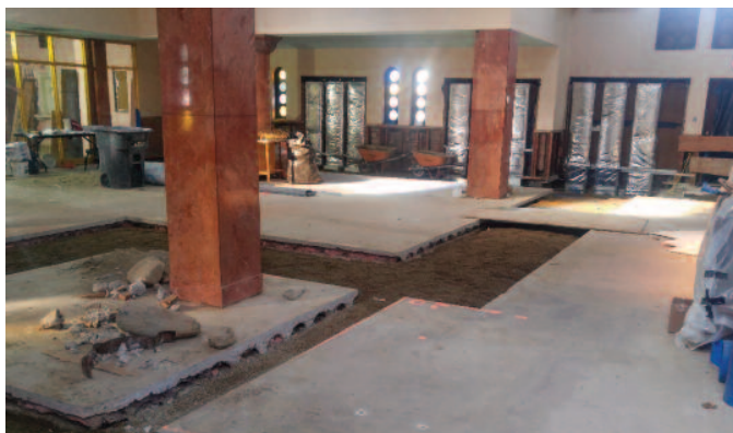
Gravel fills the channels where new BlueDuct air vents have been installed. (Oct 21)