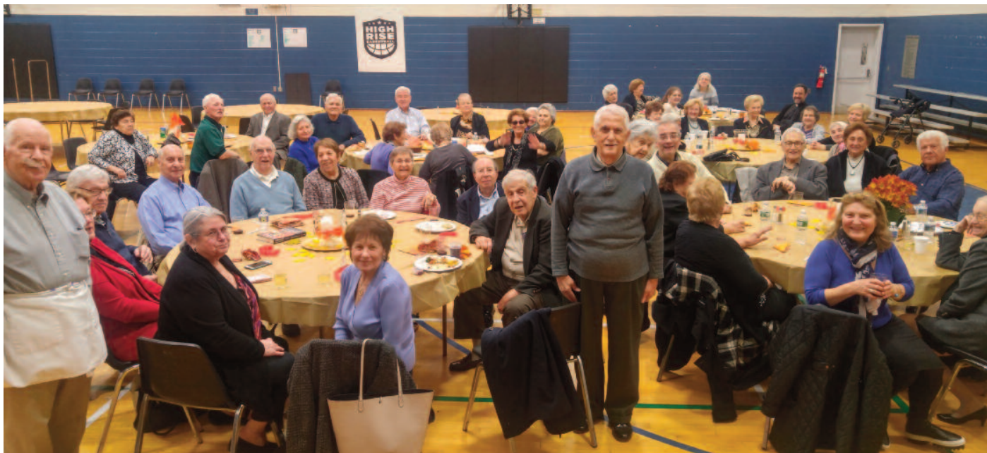
"Kali Parea" Seniors show they can have a good time while posing for a group shot during their November meeting. (Nov. 8)