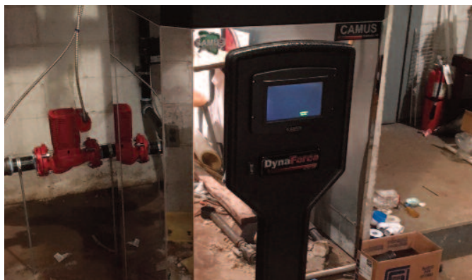
Above is our newly installed high efficiency boiler that now serves the church, hall and 1st & 2nd floor classrooms. (Nov. 10)

During this period we continued to concentrate on the Stamford Athletic Club. Water leakage persists from the woman's shower area, penetrating to the men's locker room below. Various plumbers have finally helped pinpoint the culprit. A steel beam between the two locker rooms has been compromised over the years. We are in the process of replacing it. Upon completion, we will re-tile the area outside the woman's showers and the adjoining bathroom. Certain roof areas of the gym continue to be a concern. Simple inexpensive repairs will last us into the next calendar year, at which point we will reassess replacement in 2018. One particular roof area - the roof above the club entrance - will be addressed now. The concrete caps or "coping" on its upper roof walls or "parapets" are absorbing rain water resulting in concrete block wall deterioration below. We are in the process of waterproofing these areas with streamline metal panels while addressing the coping. Security cameras have been installed at various locations throughout the complex and can now be monitored from the front desk and remotely. In the church we replaced our decades old boiler, installing a high efficiency boiler (pictures attached) which will now serve the church, hall, first and ultimately second floor classrooms. We are very hopeful of securing efficiency rebates from the utility company, which will ease some of the cost. Contact: Peter Licopantis, pglyd13@optonline.net