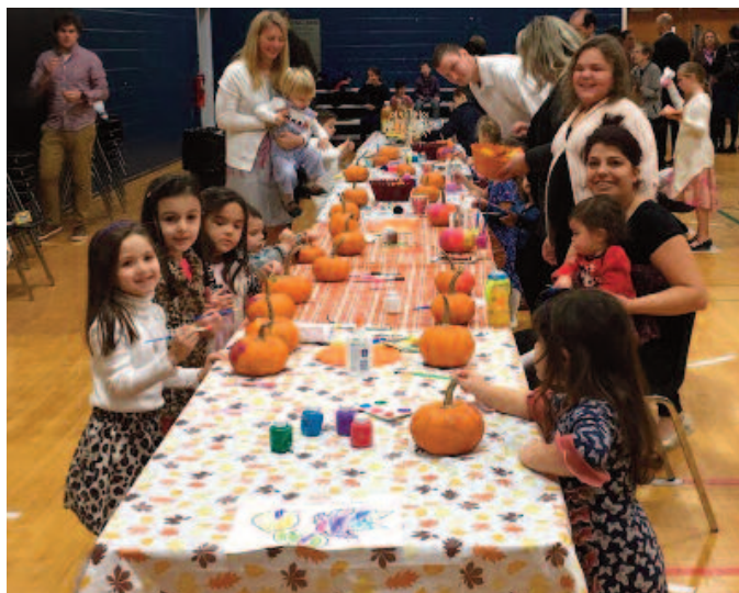
Little Angels hosts their annual Thanksgiving Gratitude event in the gym following Divine Liturgy. (Nov. 5)