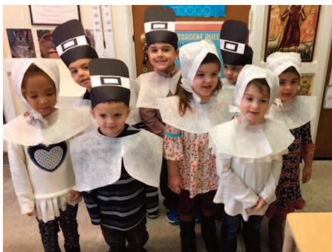
The preschool children expressed what they are thankful for, sang songs and dressed as Pilgrims for their Thanksgiving Feast. (Nov. 22)

December 25 is not the actual day that Jesus Christ was born. This day was picked centuries later because the Church wanted to counteract the elaborate and attractive pagan celebrations of the winter solstice on Dec 20/21 by establishing a Feast Day for Christians. In fact, not only does no one know the birth date of Christ, but no one in the ancient Church really cared! The four Gospels in our New Testament show far more interest in the end of his life – the fact and meaning of Jesus' Crucifixion and Resurrection. Further, the Nativity of Christ was originally celebrated together with his Baptism (what we call Epiphany on Jan 6) and only later was separated. Still, as much as we emphasize Christmas in America, it does not compare with Easter or Pascha, the "Feast of Feasts" which is preceded by Holy Week and another 6-weeks of Great Lent.