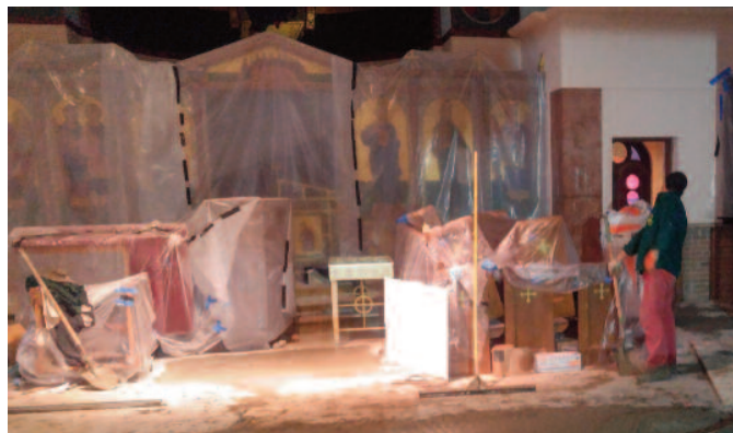
Cement is laid in the nave floor, concluding work on the sub-subterranean portion of the duct replacement. (Oct. 21)