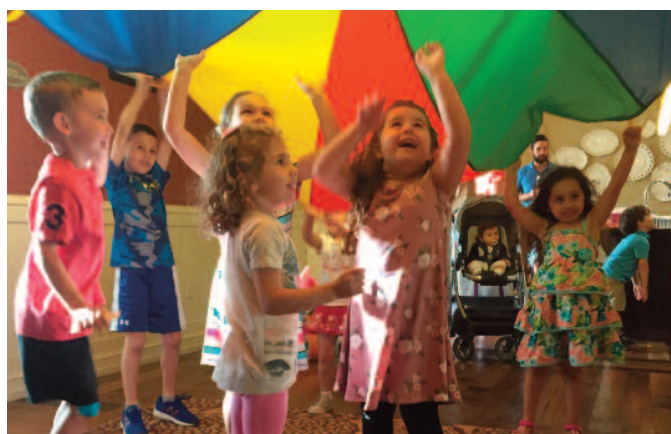
Children of Little Angels have the time of their lives playing parachute at the Family Fun Night on Oct. 7.

The weekly study guide with introduction to each book, questions and comments has produced increased dialogue and interaction.