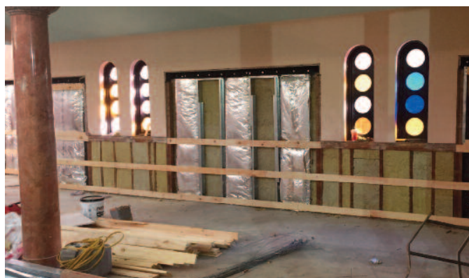
Framing out the nave walls for the wainscoting (wooden side panels) began mid-November. (Nov. 17)

beverages and olive oil. Such a vegetarian diet is actually quite healthy and nutritious, and cleanses our bodies of heavier foods and toxins. Along with restricting the kinds of foods we eat, the Church also recommends that we reduce the amount – by eating less often and by reducing (or even eliminating) snacks and dining out. The food and money we save can be used to feed the poor and disadvantaged. If you have never really fasted before, start with something doable for you (and your family), such as simply abstaining from meat, or skipping a meal in the middle of the day, or eliminating snacks at night. The purpose is for us to learn greater self-control over one of our biggest needs – eating & drinking – in order to grow in holiness and receptivity to God's grace.