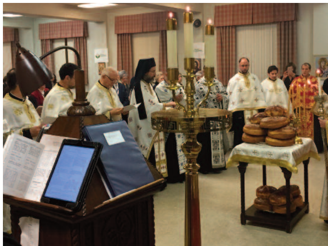
More than 10 local area clergy lead the congregation in prayer during the Vespers for our feast day, for the Archangels (Nov. 7).