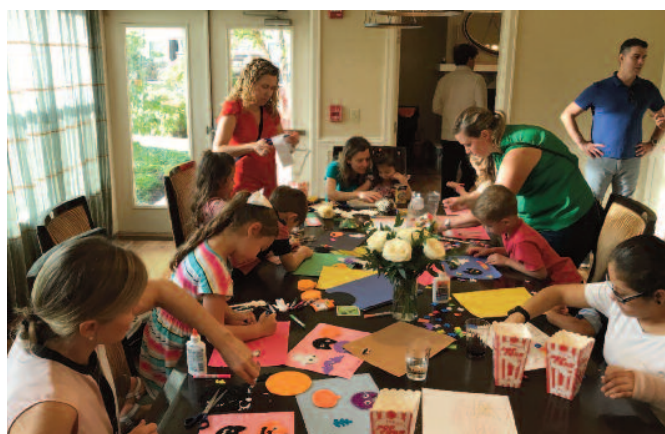
Parents help children make beautiful festive crafts as part of Family Fun Night. (Oct. 7)