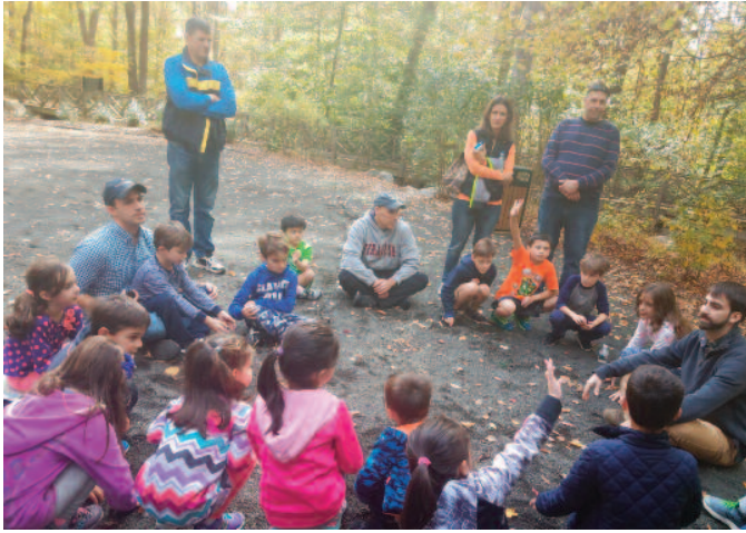
Everyone gathers for a group picture under the picnic canopy at the Stamford Museum and Nature Center. (Oct. 28)