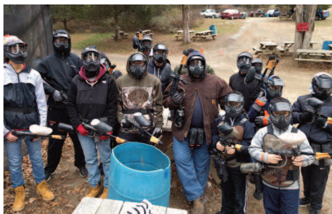
GOYs and parents from both Stamford churches get outdoors for a fun and exhilarating (and safe) day of paintball in upstate New York. (Oct. 18)