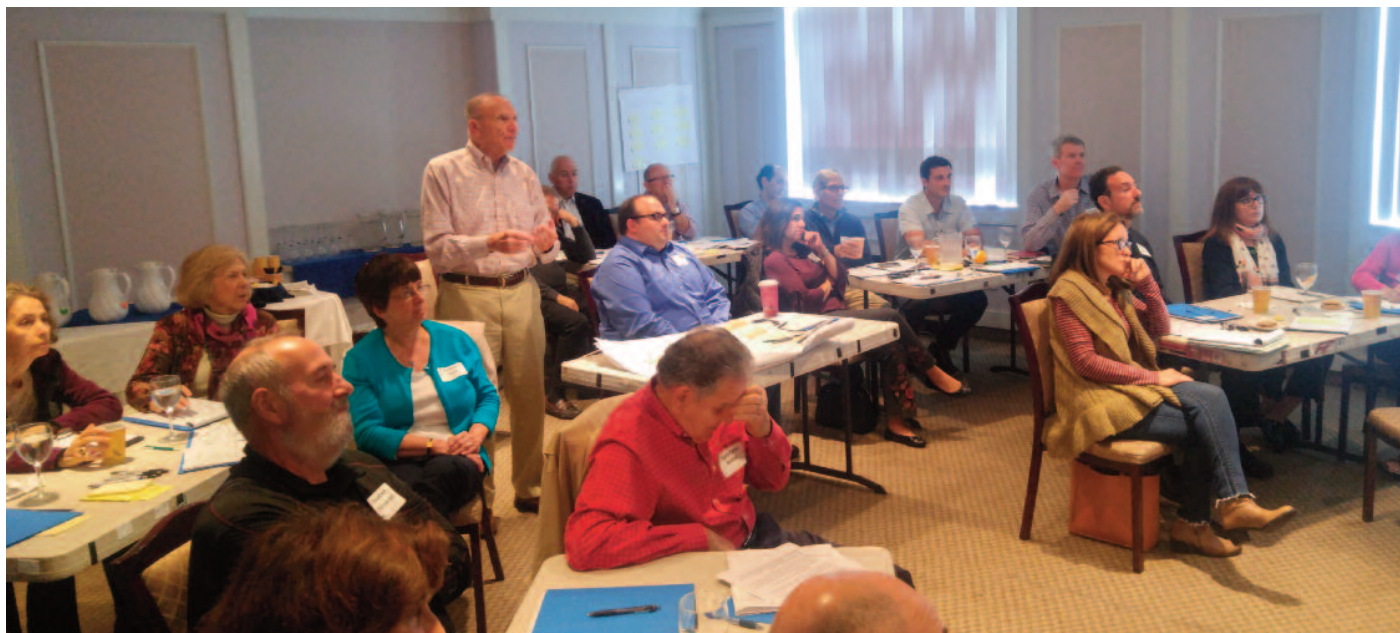
Parish Council members, ministry leaders, and staff participate in a two-day Leadership Retreat at the The Norwalk Inn. (Nov. 20)

Save the Date! Our next Family Gym and Game Night is scheduled for Saturday, January 6th, starting promptly at 5pm at our Cultural Center gym. So mark it on your calendars and if you didn't make the first one, come on out and give this one a try. The night will follow the same format as the last one: board games for adults and children of all ages; organized gym games for children ages 6-12 led by volunteer parent coaches; coloring and craft supplies for ages 5 and under; ping pong and foosball reserved for our teenagers and a free-will donation to cover pizza, salad, beverages and cookies. Families are encouraged to bring their favorite board game and a dessert, if they like. And we would love to see more Yiayia's and Pappou's in the crowd for some card playing or anything else.