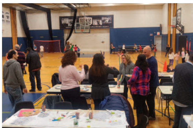
The first ever Family Gym Night held in the Cultural Center was a huge success with parents and kids alike – drawing over 90 people for games, activities and fellowship.