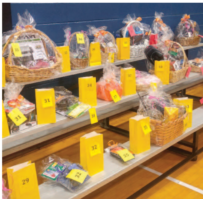
There were over 50 prizes raffled off after bingo had ended – so many to choose from!