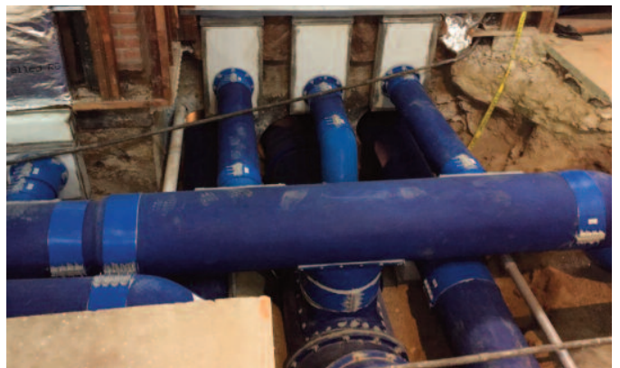
Sub-concrete ductwork – before and after

For the physical fast, there are two stages: 1) from Nov. 15 to Dec. 11, we fast from meat and meat by-products and consume boned fish, beans, pasta, rice, vegetables, grains and fruits; then 2) from Dec. 12-24, we are urged to abstain from boned fish as well. On weekdays, we are also asked to refrain from alcoholic