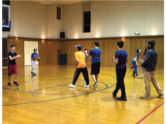
The teens hang out and fun on the court, playing volleyball and basketball until late (Oct. 28).

Please mark your calendars for these upcoming events: