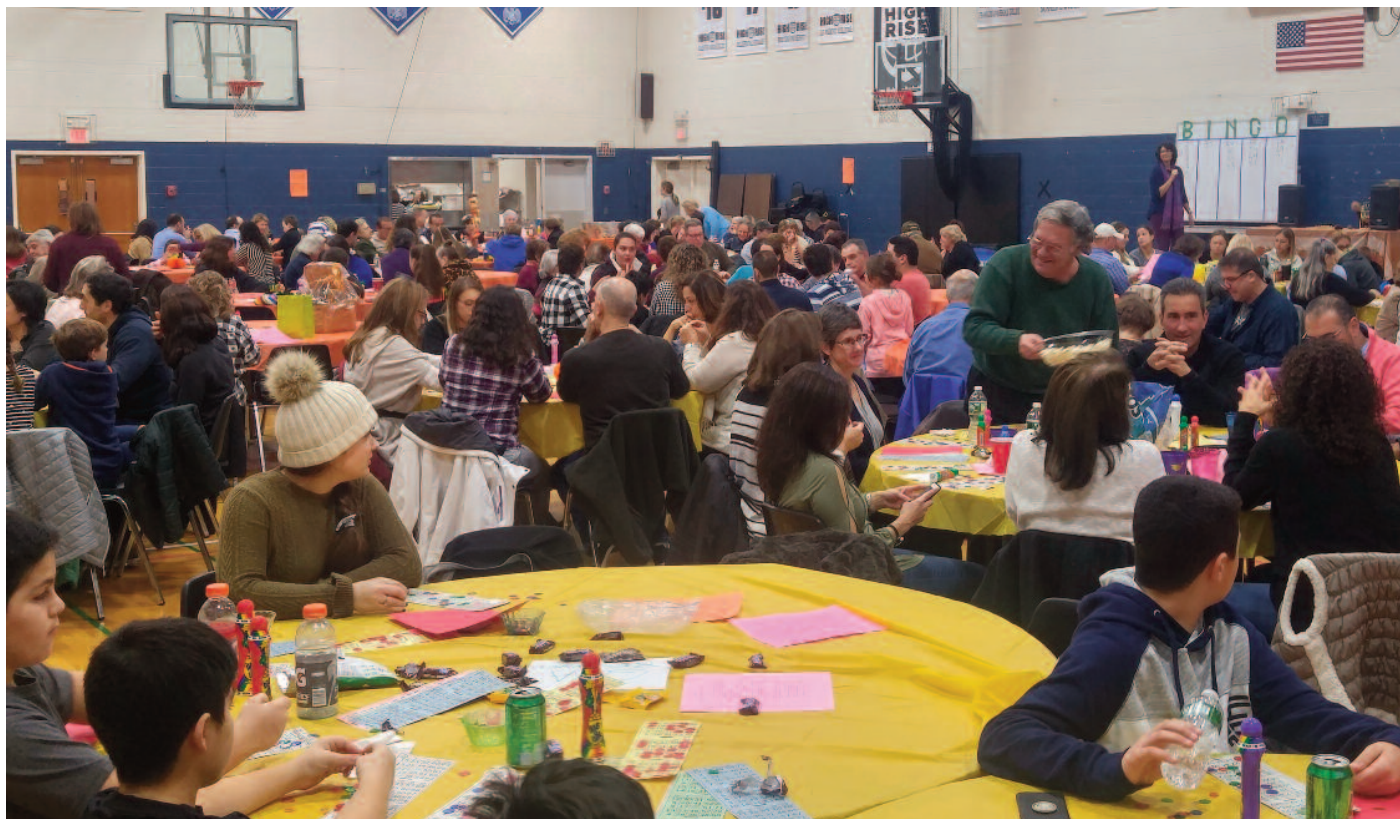
A record attendance of over 275 people were present at this year's Turkey Bingo, hosted by our Ladies Philoptochos on Saturday, Nov. 11.