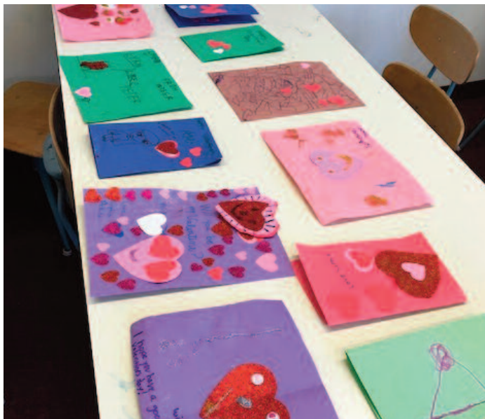
Valentine cards made by the Church School children during Philanthropy/Service Sunday to be mailed to St. Basil's Academy