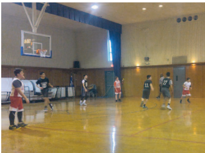
The 'Stamford United' JV division boys basketball team defends against the team from New Rochelle during their game (Jan. 21)