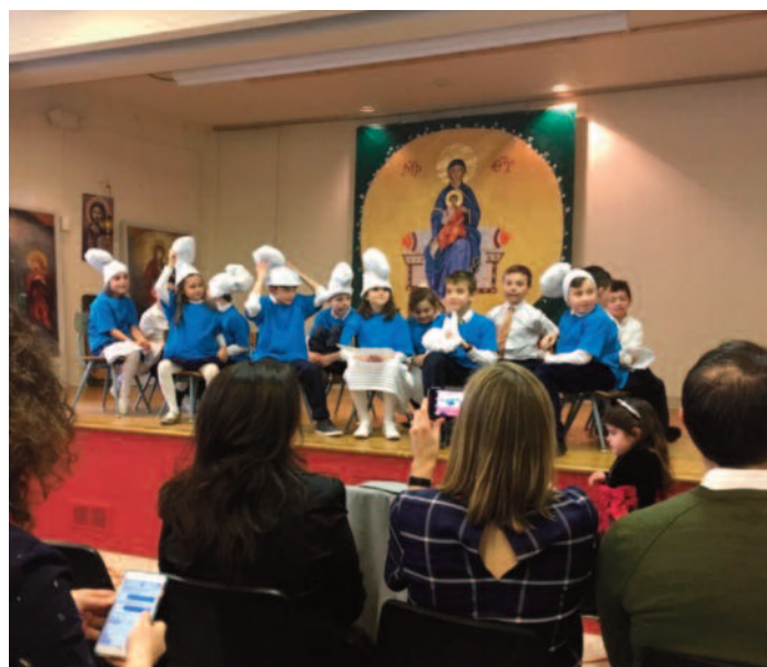
Greek School students perform a fun final act during the Three Hierarchs program dressed as Smurfs. (Jan. 28)