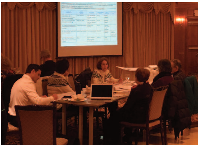
A group of 25 participates in the parish Leadership Retreat part 2 at the Norwalk Inn. (Jan 20)