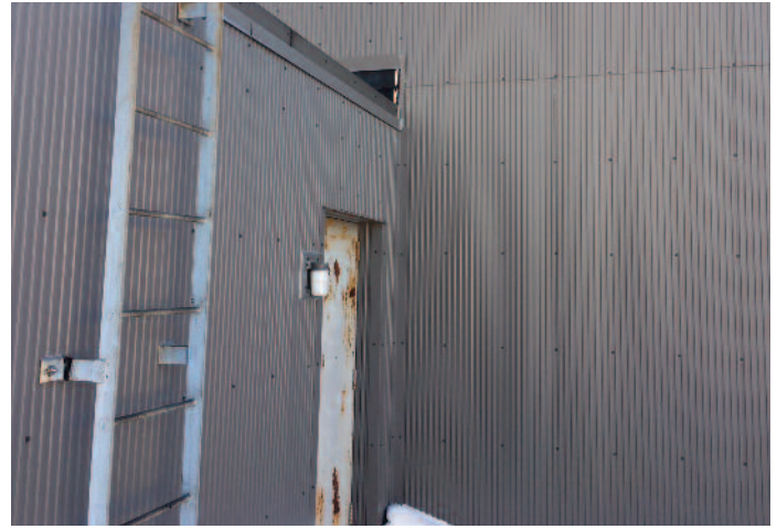
Metal Cladding and Clapping Before & After