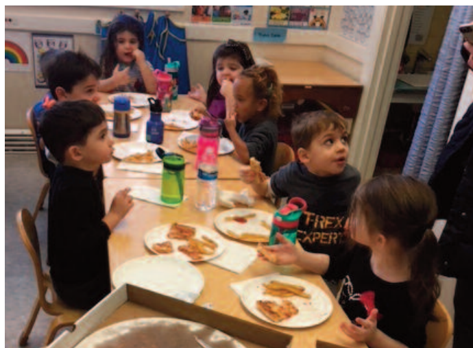
The Preschool children enjoying Pizza Day! ( Jan. 18th)