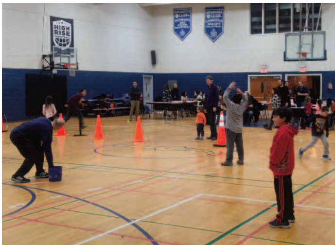
Children enjoy various activities in the gym during Family Gym Night on Saturday, January 6.