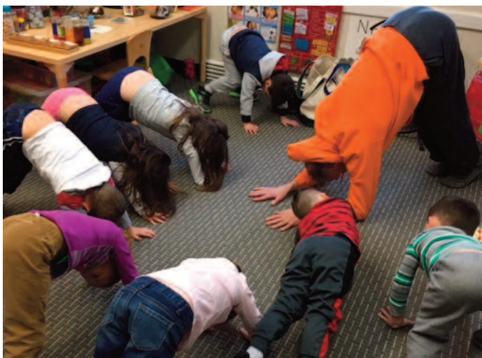
The Preschool children having a yoga session (Jan. 11th)