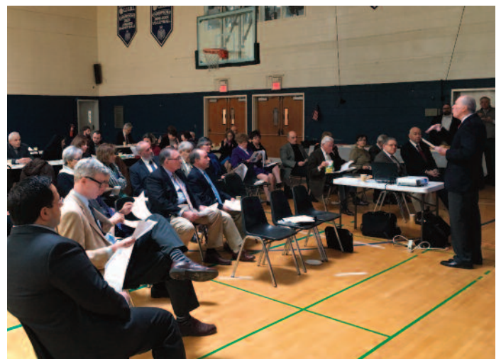
Over 50 attended the General Assembly in the gym following Liturgy. (Jan 21)