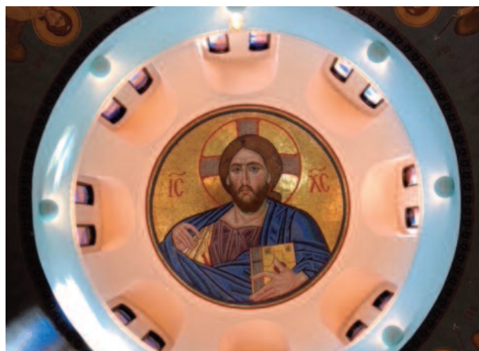
Mosaic icon of Christ Pantokrator (Almighty) in the dome now gleams after professional cleaning.