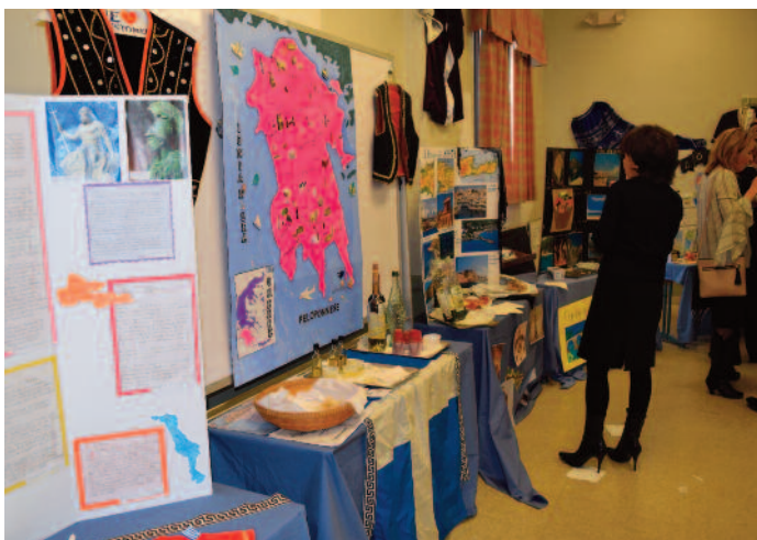
Greek School students construct detailed displays of the various geographical areas of Greece as part of the Three Hierarchs Program. (Jan. 28)