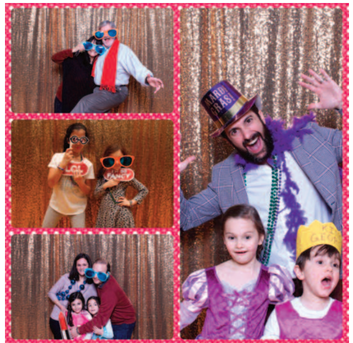
Mardi Gras photos