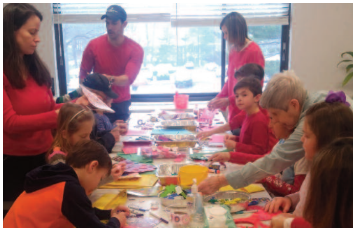
Children of Hope & Joy make heartfelt Valentine's Day cards with and for senior residents at Atria Senior Living (next to the church) during the annual "Valentine's Visit." Feb 10