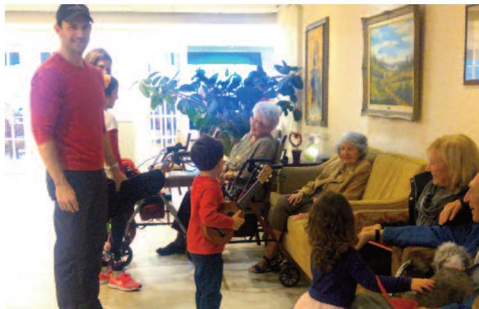
Atria residents were moved in body and spirit by the warmth and generosity of our children who hand-delivered Valentine's cards and performed songs & jokes. Feb 10