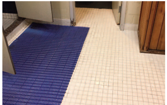
Re-tiling of the areas surrounding the woman's showers in the Stamford Athletic Club (SAC). Feb 15