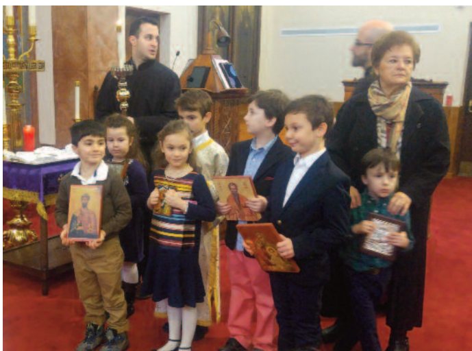
Children of the Church School, with icons in hand, process with altar servers to the solea as part of the Sunday of Orthodoxy observance. Feb 25