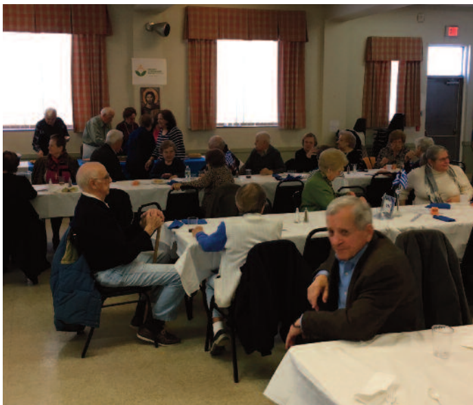
Kali Parea Seniors group meets in the hall for their monthly luncheon meeting (Mar. 8)