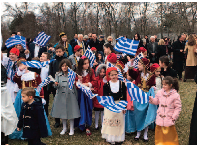
Archangels and Annunciation Greek School children wear traditional outfits and wave Greek Flags festively during the Flag Raising Ceremony outside Annunciation church. (Mar. 25)