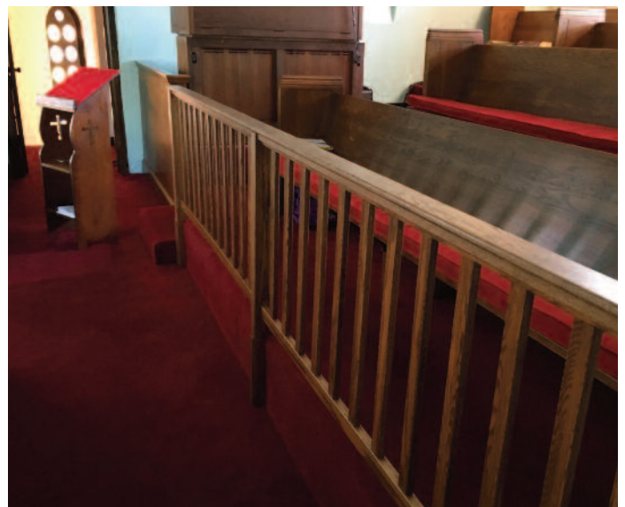
Master cabinet maker Dennis Koukourakis re-cycles unused wood from a pew to make a beautiful new railing in the church loft. (Mar. 6)

A new hung ceiling has been installed outside the entry to SAC's men's locker room. This completes aesthetic and structural repairs emanating from prior water leaks. We are happy to be putting this issue to rest. We are initiating the process of steam cleaning the women's locker room carpeting. Modifications were made to the Church's boiler and domestic hot water heater, as recommended by our insurance company and Aquarian Water. We have taken measures to make our parking lot more secure, by adding lighting and video monitoring. This work is near completion and should deter undesirable situations. We have also requested that the apartment complex adjoining the eastern edge of our lot repair all gaps in their fence line. On March 14th B&G performed inspection at the SAC where the building abuts Atria's to the north. Rainwater has been penetrating Atria's courtyard, depositing water into our gym and festival storage area. We will continue exploratory work, along with Atria, to find a solution. We also reviewed various roof areas in need of replacement. Finally, we have created a new tracking list of work items to be prioritized going forward. Contact: Peter Licopantis, pglydl3@optonline.net