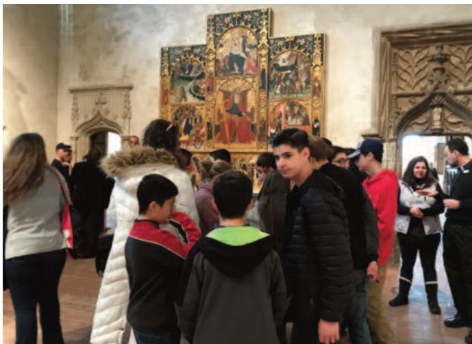
Our GOYA gathers in a large room at the MET Cloisters (upper Manhattan) at the beginning of the annual GOYA DAD Scavenger Hunt. (Mar. 17)