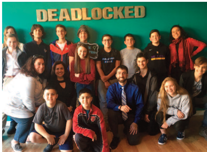
The GOYA takes a group picture after successfully 'escaping' from the difficult trap rooms of the 'Deadlocked Escape Rooms' venue in Stamford. (Mar. 24)

The assembly closed with a short play of the Evangelismos tis Theotokou (Annunciation) by Deena Amanatides and Antonio