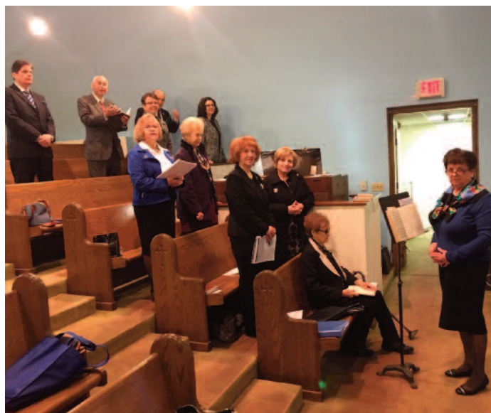
Members of our choir fill the sacred church space with melodious song during the Annunciation Liturgy at Annunciation. (Mar. 25)