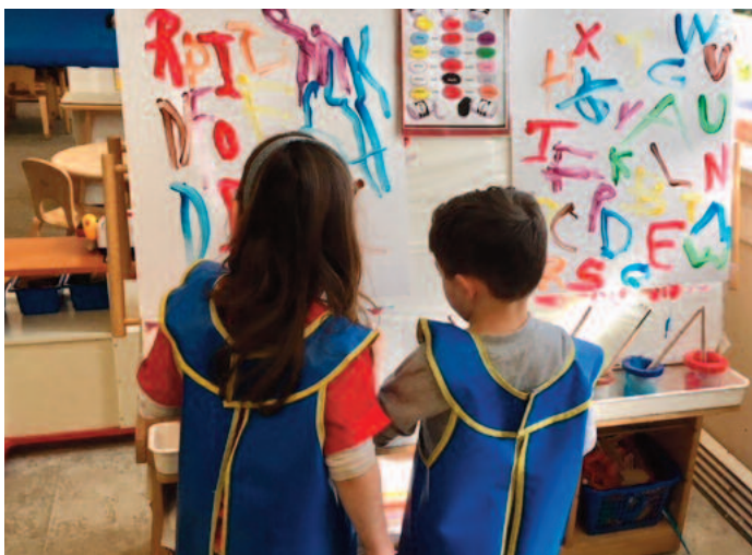
The children of Preschool work on their letters, utilizing myriad colors and easel space. (Mar. 19)