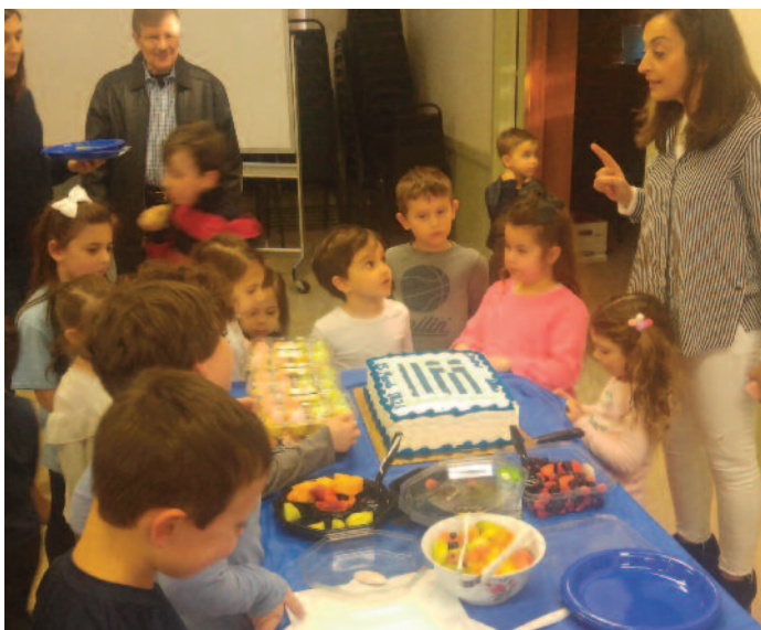
Following the formal program, students, teachers and families socialize and enjoy dinner and festive desert in the hall. (Mar. 19)