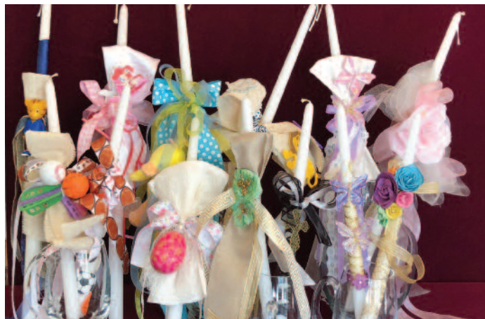
The Greek School PTO sells colorful Easter Lambathes (candles) outside the main office during Lent and Holy Week. (Mar. 19)