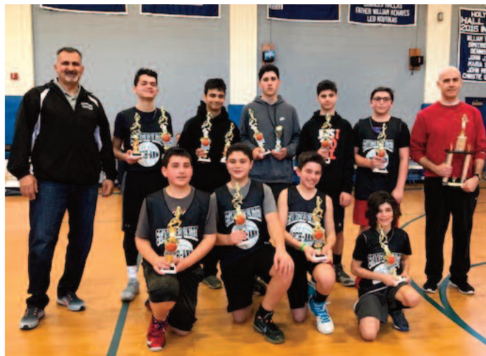
Boys of the JV basketball team hold their 1st place trophies at the CEOBL Awards Ceremony at Holy Trinity gym in Bridgeport. (Mar. 17)

week experience. Our primary goal will be to help construct a home for a needy family, but we will also spend time with teenage orphans at the St. Innocent home, and spend time with the local people.