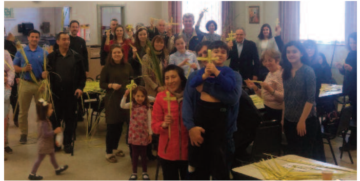
Young and old alike raise their freshly made palm crosses during the annual Lazarus Saturday palm plaiting. (March 31)