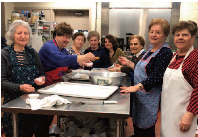
Women of the parish bake Easter cookies at the Cultural Center kitchen and have a good time doing so. (April 2)