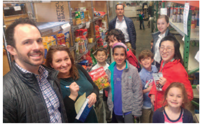
Parents and children of HOPE/JOY pause their shelf-stocking activity at the Lower Fairfield County Food Bank for a quick picture. (April 4)