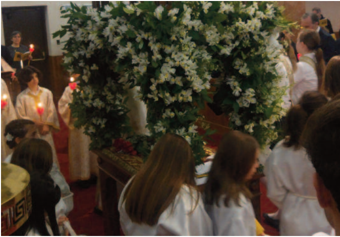
The handmaidens adorn the symbolic tomb of Christ with fragrant rose petals on Holy Friday Evening. (April 6)