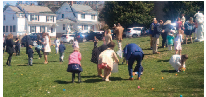
Hope & Joy puts on the annual Easter Egg Hunt on a crisp Easter Sunday morning to delight of 30+ children. (April 8)