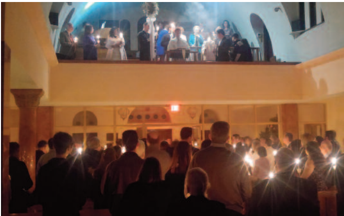
Man-made lighting is turned off in deference to candle light during the Saturday night Anastasi service, as the congregation waits for the joyful exclamation that "Christ is Risen!" (April 7)