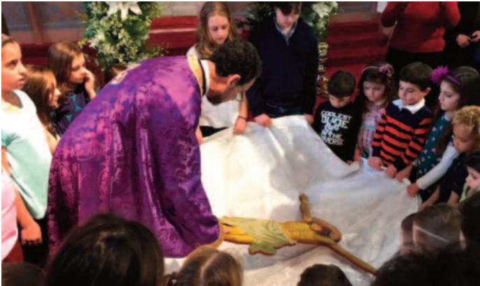
Children take part in the Unnailing Service on Good Friday afternoon by wrapping the icon of Christ crucified. (April 6)