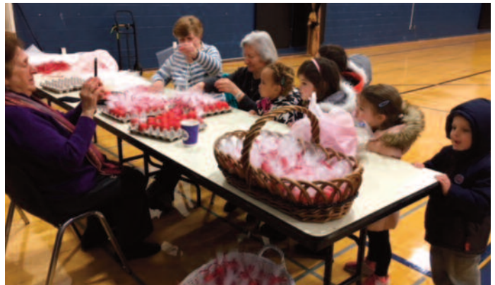
The preschool children watch the ladies prepare red eggs for Easter Sunday. (April 3)