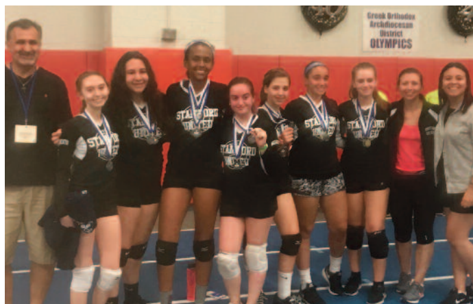
The Stamford United girls volleyball team smiles with their coaches after a 2nd place finish at the DAD Olympics. (5/26/18)