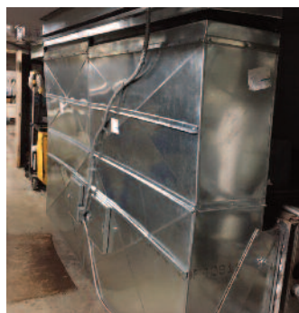
The lower section of the pool unit at SAC was replaced in May. (5/8/18)