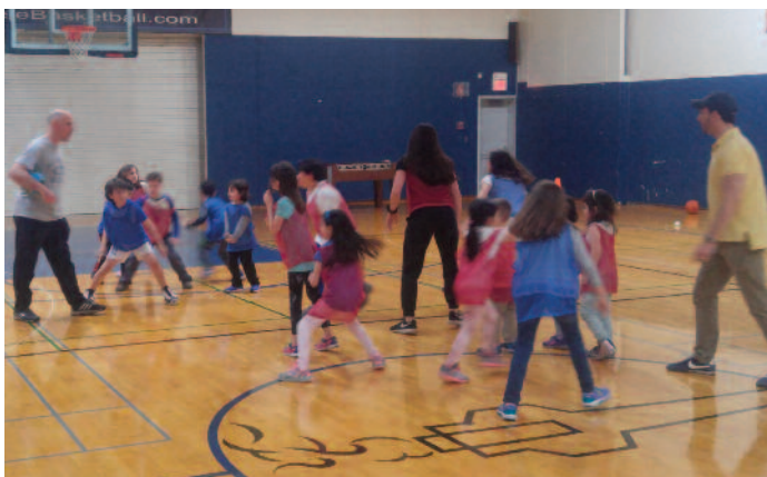
Youth enjoy a game of "Ship to Shore" during Family Gym and Game Night. (4/28/19)