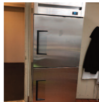
Cultural Center kitchen received a new full-size refrigerator after its predecessor broke. (5/22/18)