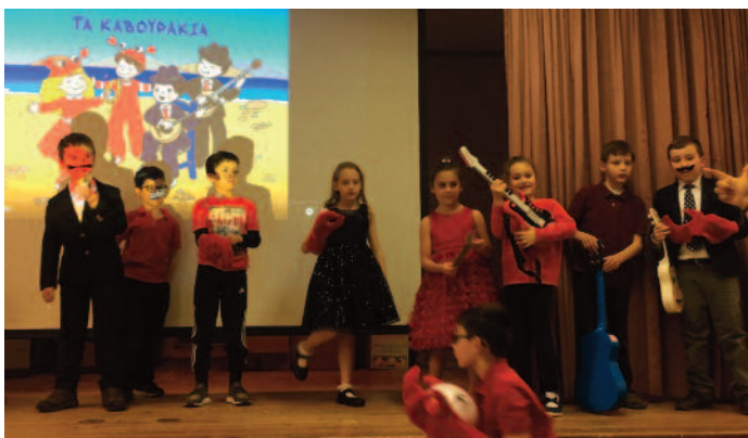
Greek School children mark the end of a successful year with song, dance, and family party in the hall. (5/24/28)