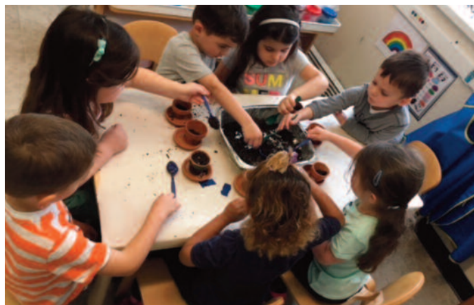
The preschool children plant sunflower seeds during their study unit on seeds. (5/14/18)