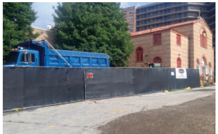
Metal fences with screens are erected around the church building as Phase II begins in earnest. (7/23/18)