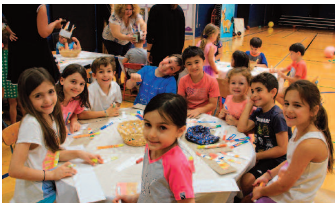
The eldest children gather for a warm hearted picture during the craft session at VCS. (8/1/18)