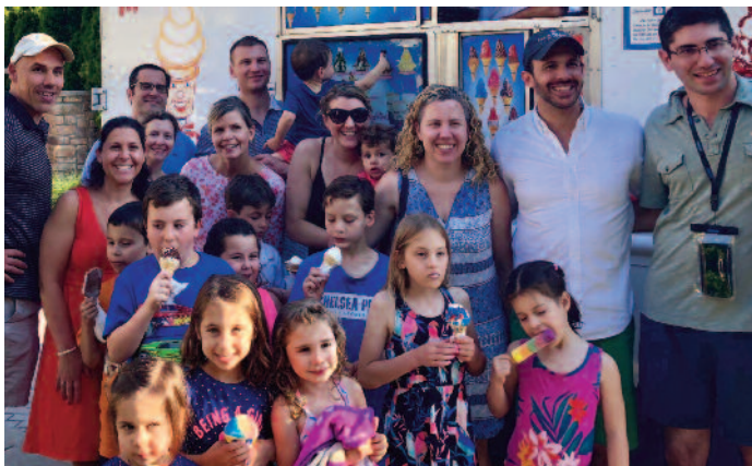
Hope/Joy and Little Angels hold a joint year-end Movie Night celebration, including swimming, games and even an ice cream truck! (6/30/18)