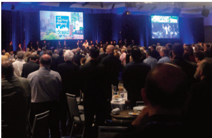
Opening: Over 1000 clergy and laity stand for opening prayers at the 2018 Clergy Laity in Boston, MA on Monday, July 2.