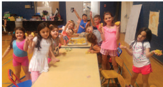
Children of Greek School Camp session 1 hold up freshly baked home-made Kouroulakia (Greek sweet cookies). (7/25/18)