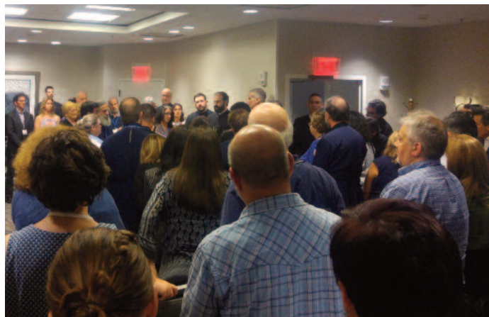
Workshop: Various workshops are held at Clergy Laity, which are more intimate and offer a chance for delegates and observers to tackle ministerial and administrative challenges with focus and attention. (7/4/18)