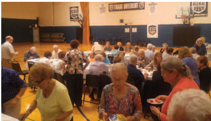
The "Kali Parea" Seniors enjoy a tremendous spread of desserts and coffee during their June Luncheon. (6/14/18)