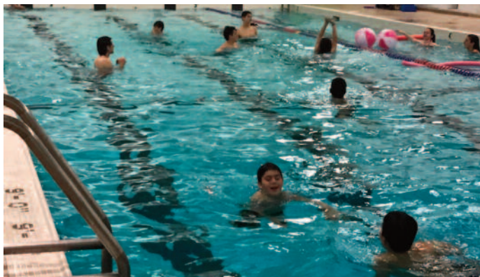
Teens from Archangels & Annunciation enjoyed full use of Greek Cultural Center facilities at the GOYA "Gym & Swim" year-end event. (6/9/18)