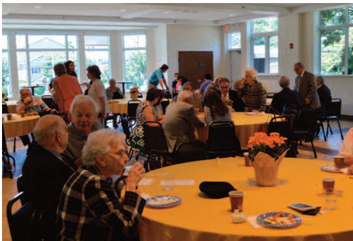
Parishioners thoroughly enjoy the gorgeous new hall, kitchen, and atrium for the first time on Sunday, August 4.