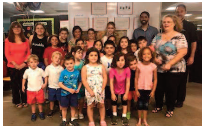
The entire group stands for one last picture before the close of VCS 2019! (Aug 2)