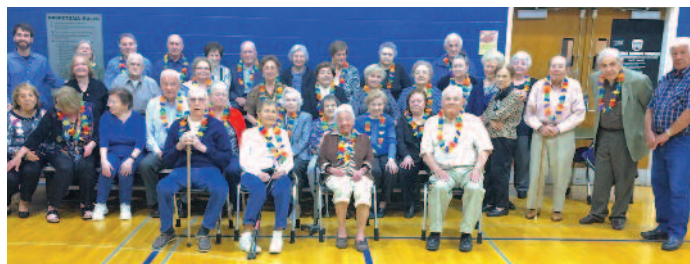
Over 40 members of our Kali Parea seniors take a wonderful group shot at their final meeting on June 13.