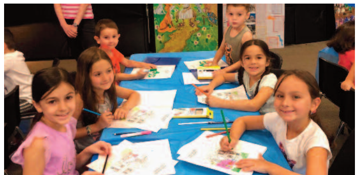
Children sport their pearly whites during craft time at Greek School summer camp, held in the 2nd floor of the Greek Cultural Center. (July 24)