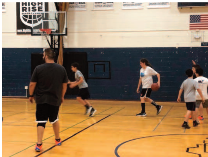
JV Basketball first practice (Oct 2)