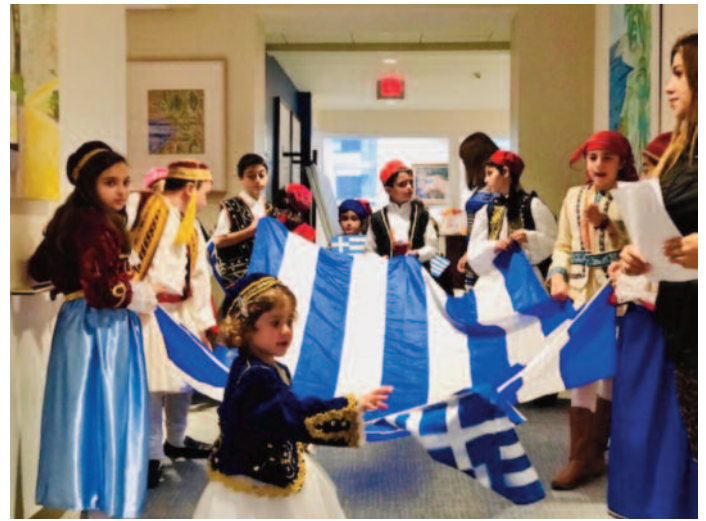
Greek School OXI Day celebration

The next event will be the pizza party at Summer St Kitchen on November 24 after the annual Stamford Thanksgiving parade. More details to follow via evite.com. The annual Christmas party is tentatively scheduled for December 14.