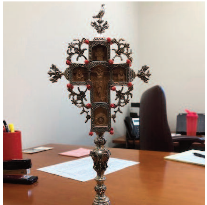
Beautiful new Chalice Set and Blessing Cross donated to our church (Oct 11)