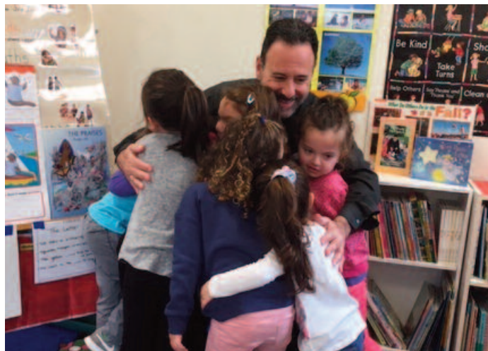
Ending the lesson with a Group Hug! (Oct 29)