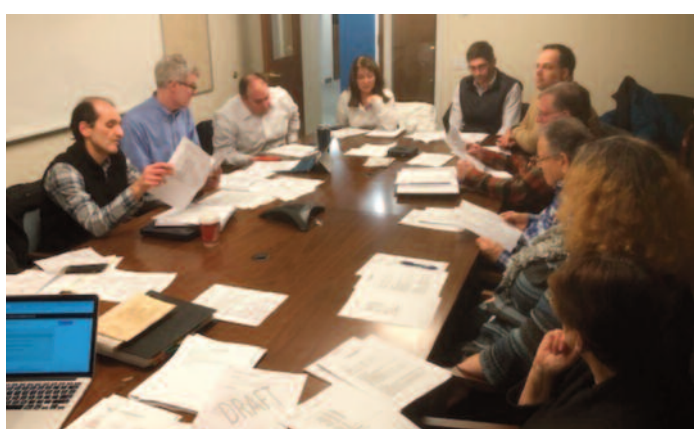
New Parish Council meets (Jan 17)