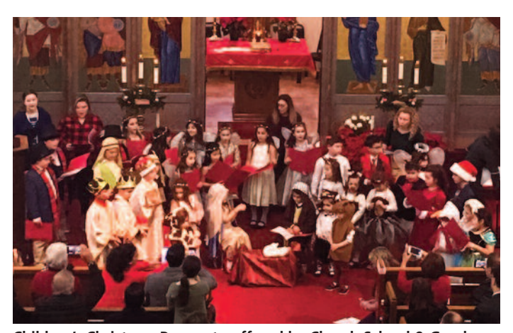
Children's Christmas Pageant - offered by Church School & Greek School after Liturgy (Dec. 15)