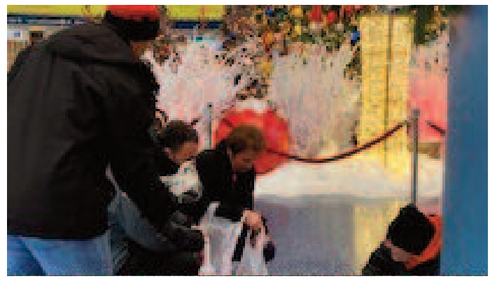
Serving a homeless person laying down in Penn Station (Dec. 19)