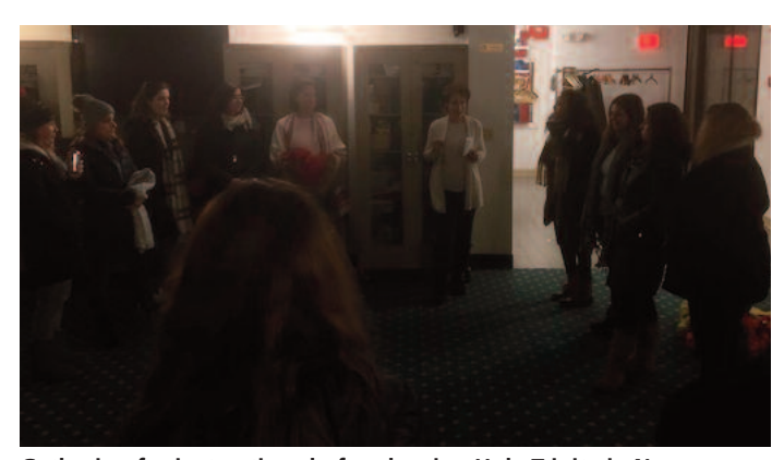
Gathering for instructions before leaving Holy Trinity in New Rochelle for Soup Run (Dec 19)